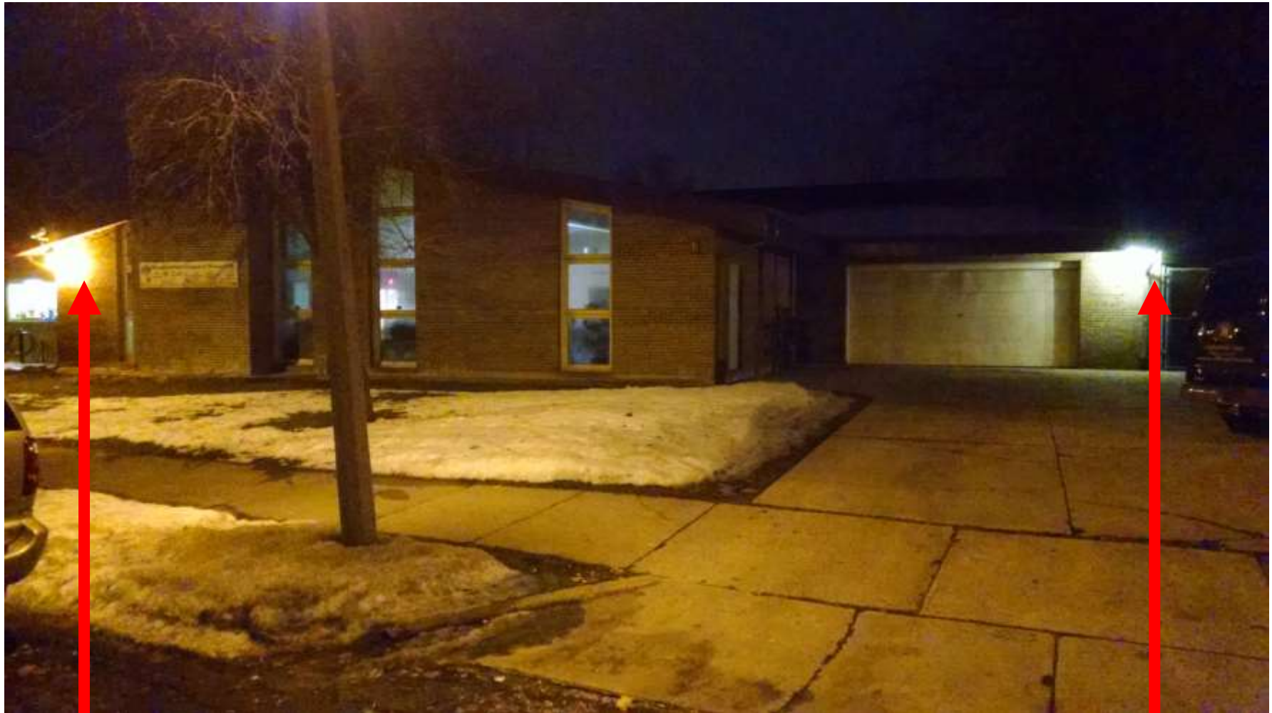
Replace with Latitude fixture