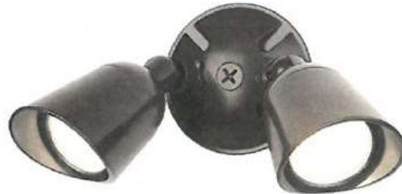
Latitude 6"x14" fixture