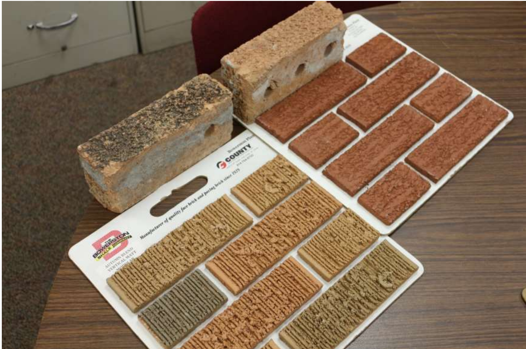
Use texture of red brick as seen on the right but in the “Autumn Blend” color palate at left.