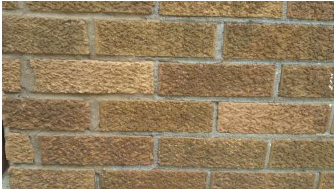
Detail of original brick