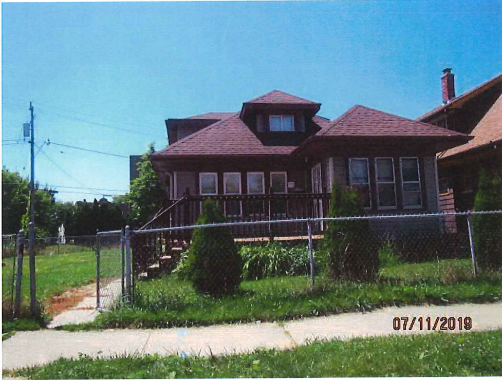
4439 North 27 th Street