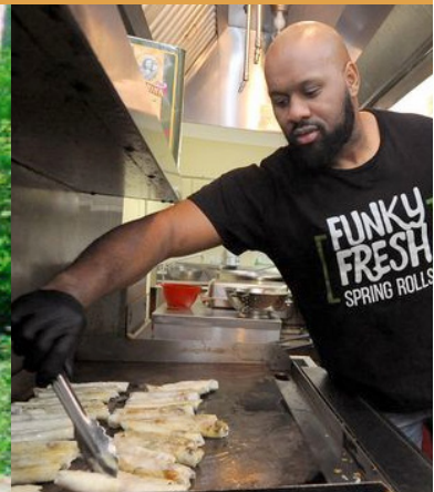
Funky Fresh Spring Rolls

Experienced lead tenants have committed and others are currently in negotiation. These entrepreneurs share a common vision for hiring locally, providing mentorship and training opportunities, and strengthening local communities.