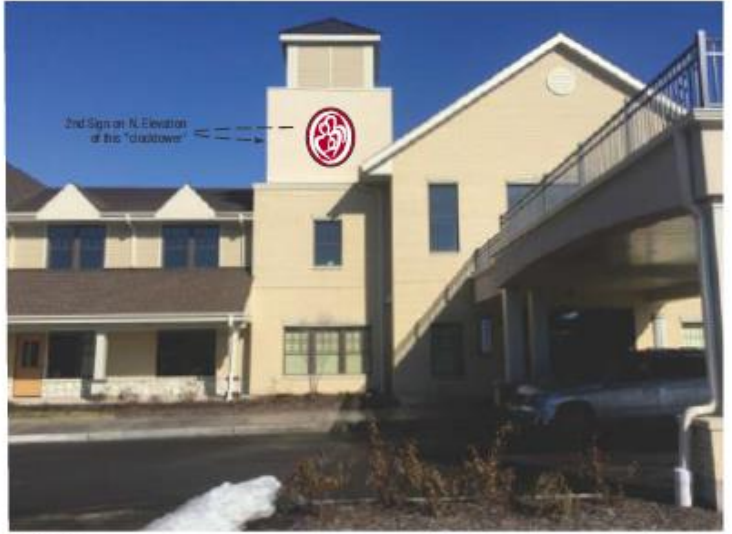
S. Elevation 1/16" = 1'-0" SCALE