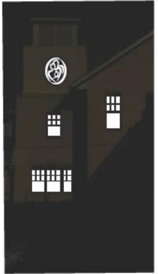
S. Elevation - Night View

View from West North Avenue, looking northeast