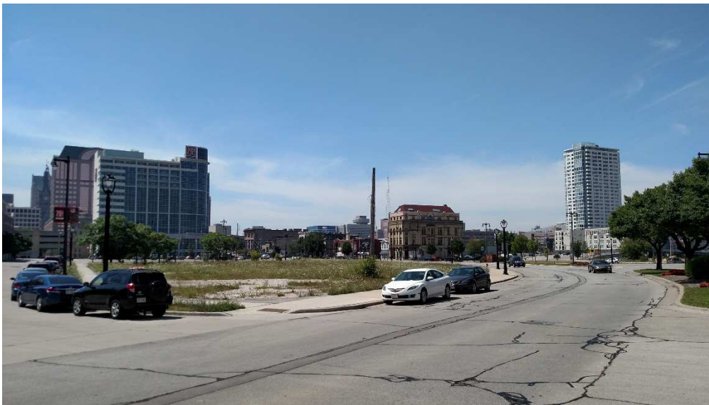
View from NE (Water Street)