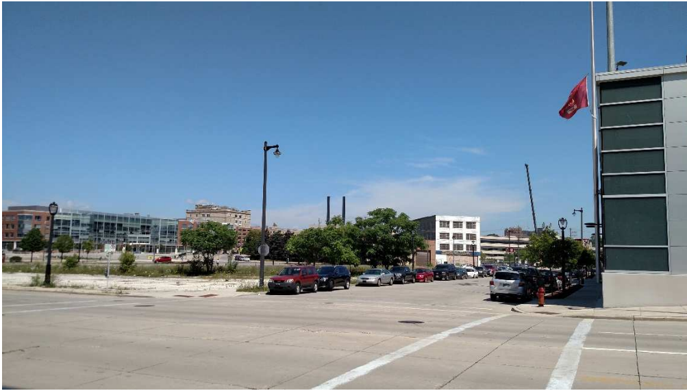
View from SE (Market & Knapp Streets)