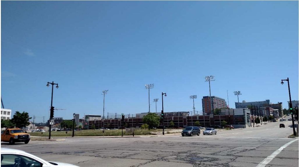
View from SW (Water & Knapp Streets)