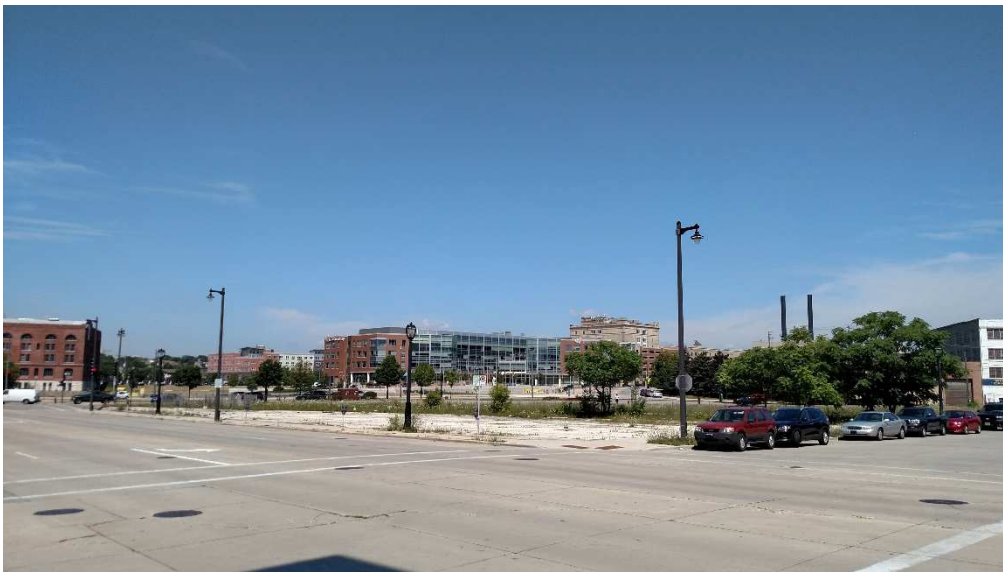
View from SE (Market & Knapp Streets)