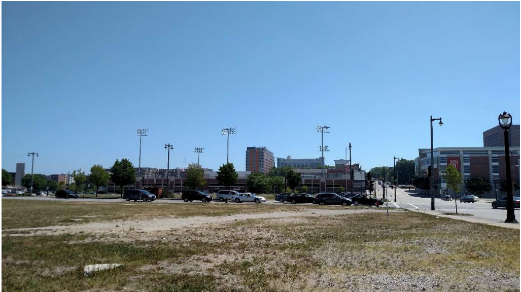
View from West (Water Street)