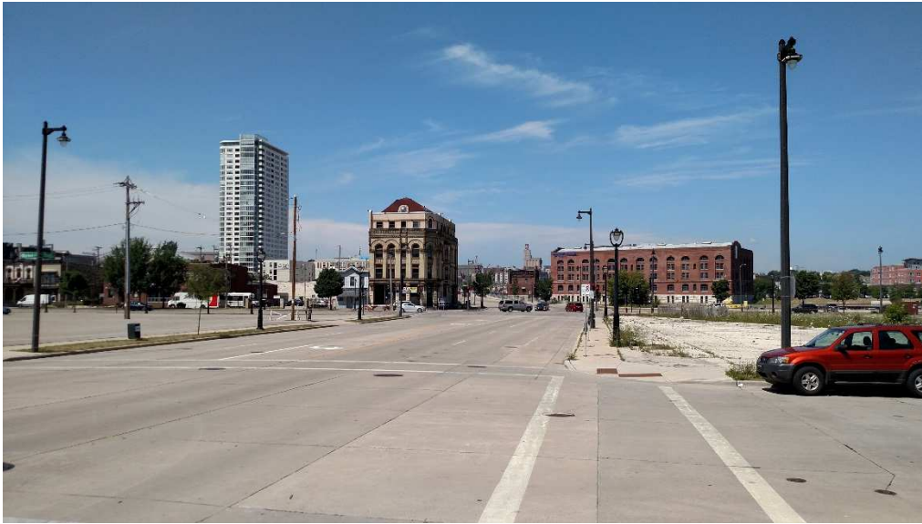
View from East (Market Street)