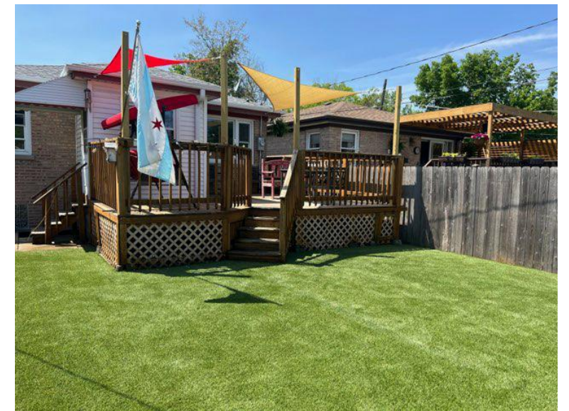
9 ARTIFICIAL GRASS