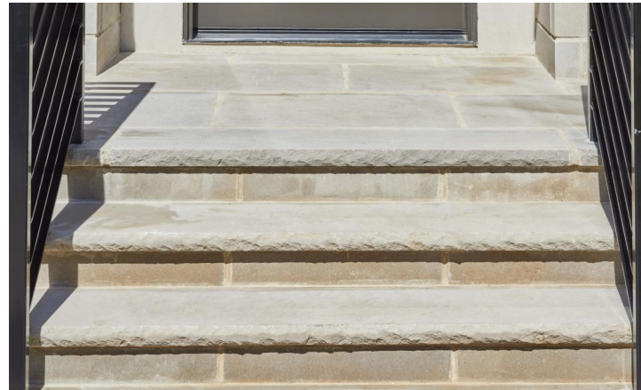
2 INDIANA LIMESTONE TREADS & RISERS