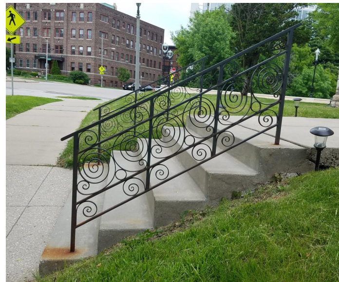
8 EXISTING STAIR RAILING