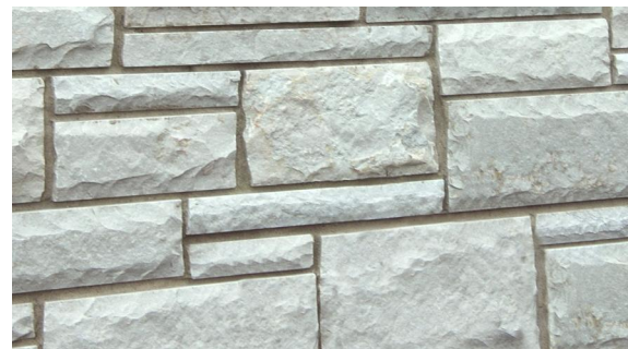
7 VALDERS STONE VENEER