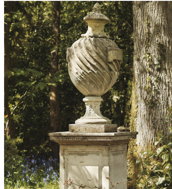
3 POPE'S URN