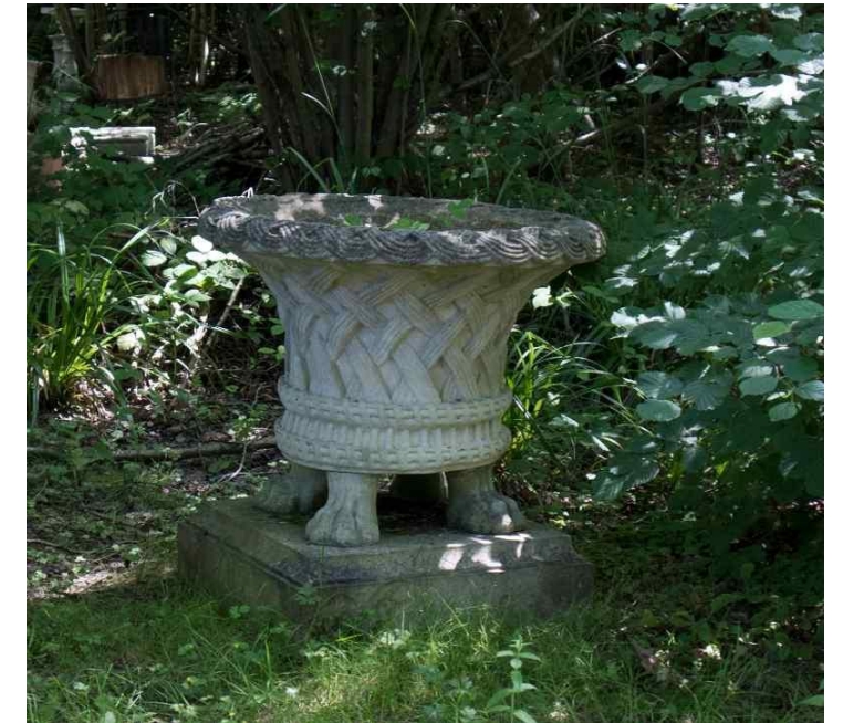
4 BASKETWEAVE URN