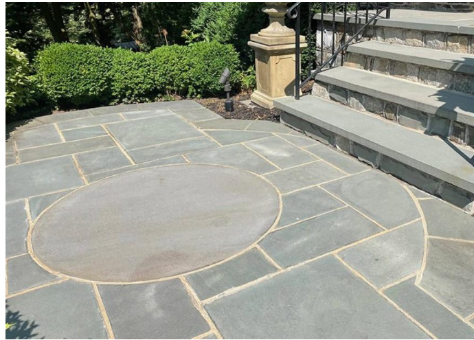
1 BLUESTONE PAVERS