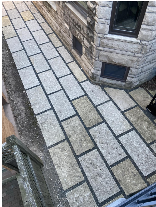
5 EXISTING PAVERS