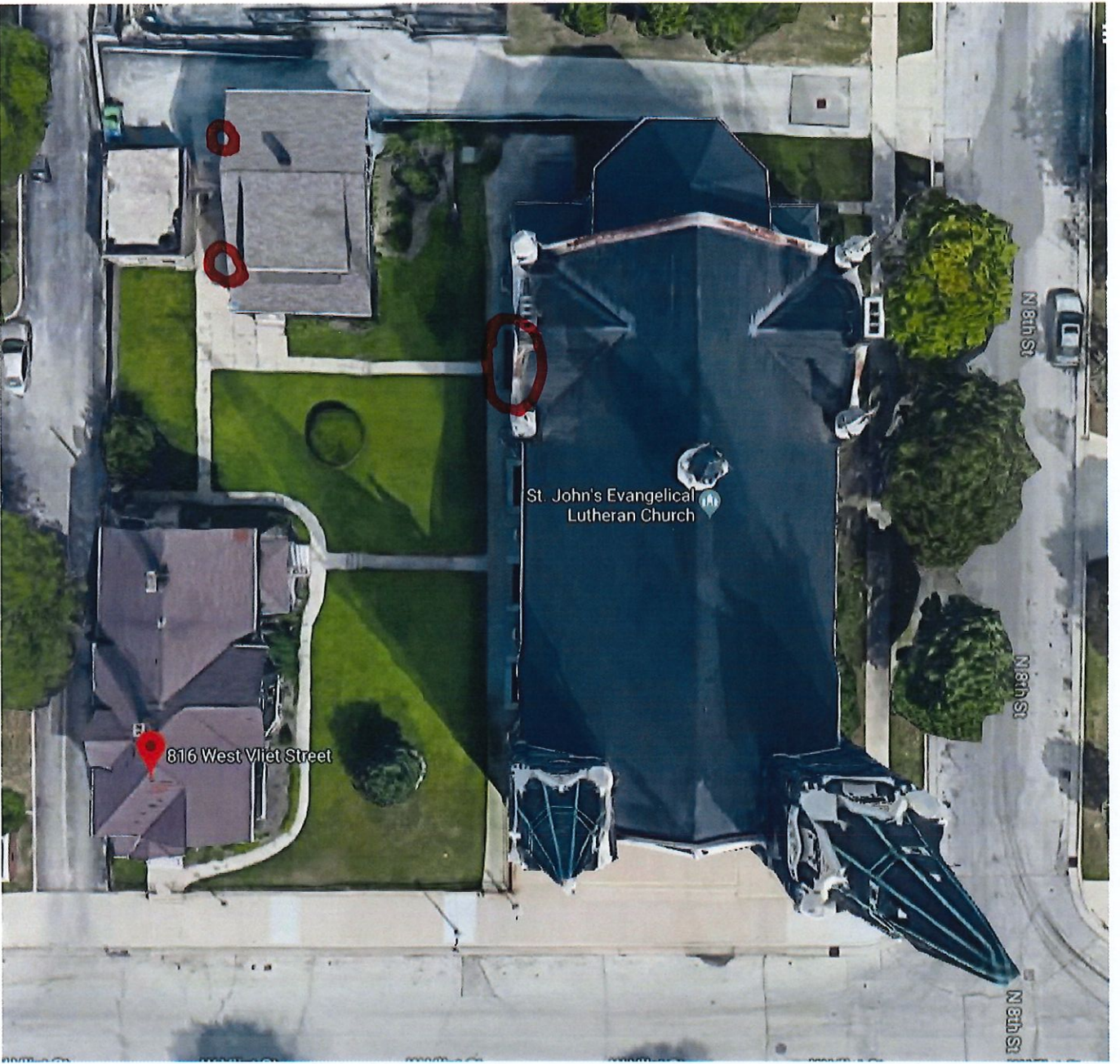
Existing site conditions.