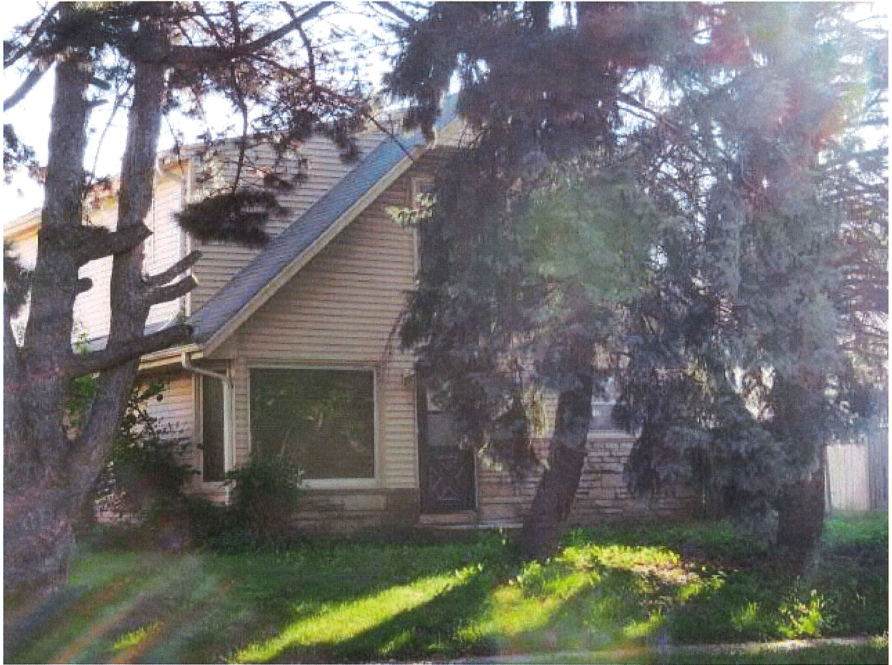
8654 W Medford Ave