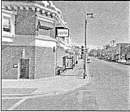
Proposed Sign Location

.125 Alum panel Die cut vinyl graphics applied