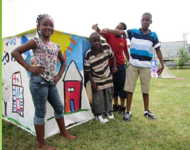
Proud artists and their structure