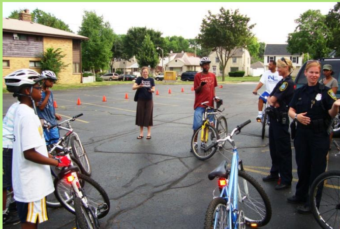
MPD Bicycle Safety Class