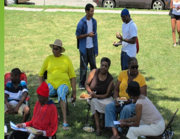
Residents enjoy a day in the park