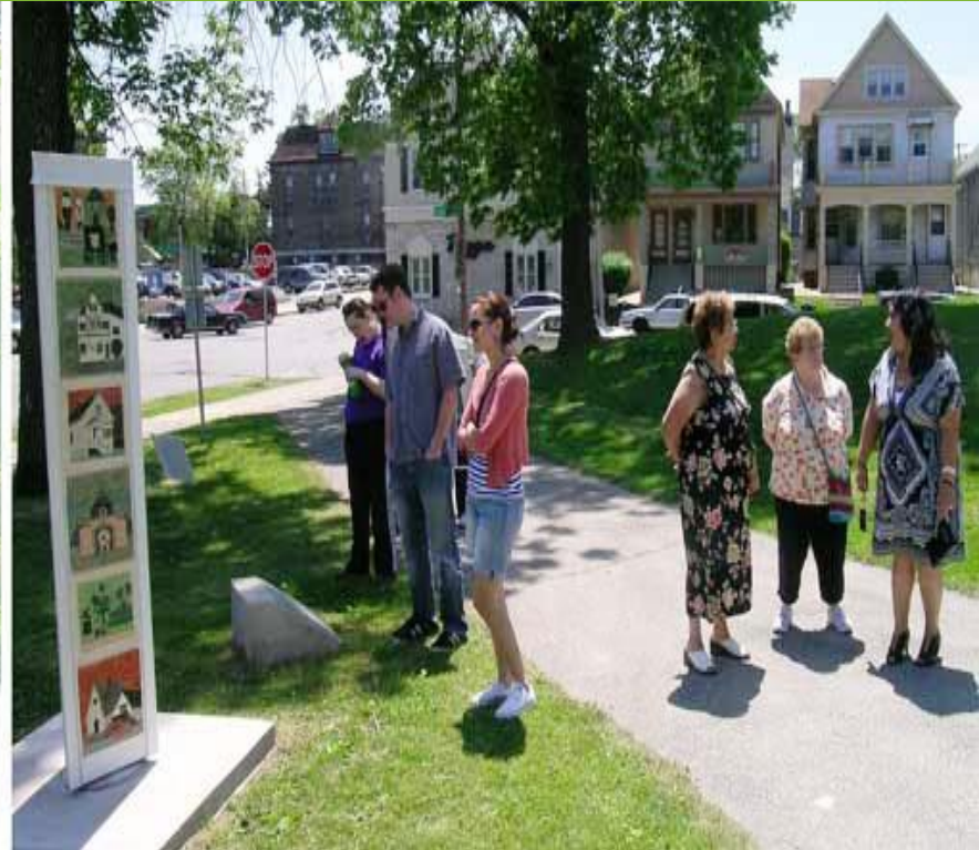
Native Couple Bench and Youth Art Pillar in Kosciuszko Park