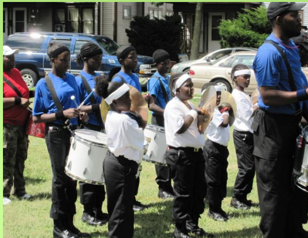
Nei Phi Neph Fraternity Drum Line