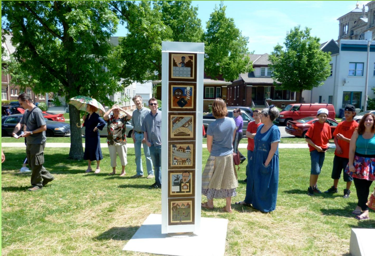
Youth Art Pillar in Kosciuszko Park