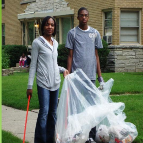
Neighborhood Clean Up