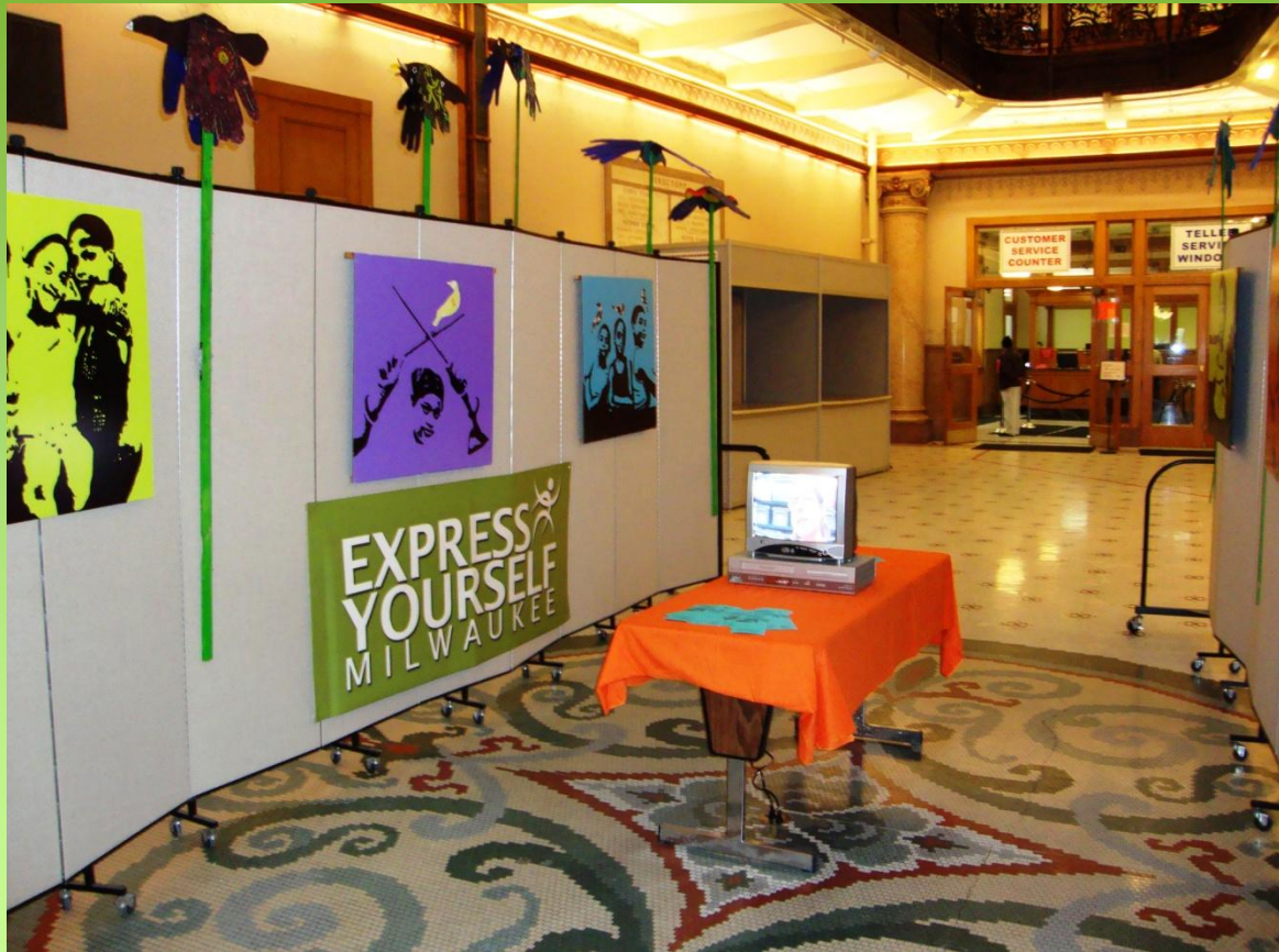
Express Yourself Milwaukee City Hall display.