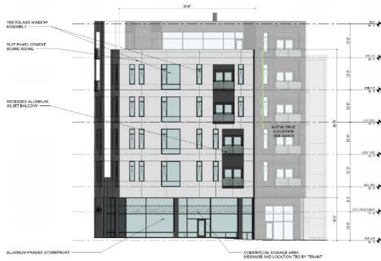
1 SOUTH ELEVATION - ANGLED SCALE: 1/8"=1'-0"