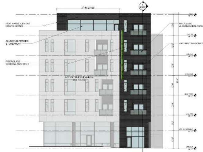
2 SOUTH ELEVATION - FLAT SCALE: 1/8"=1'-0"