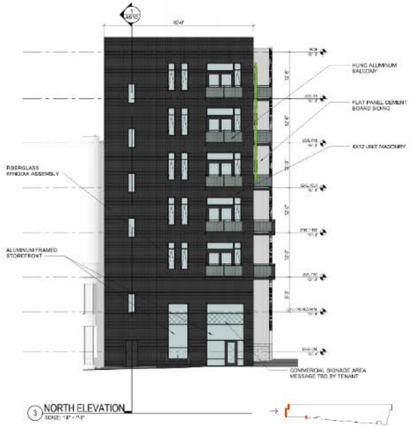
3 NORTH ELEVATION SCALE: 1/8"=1'-0"