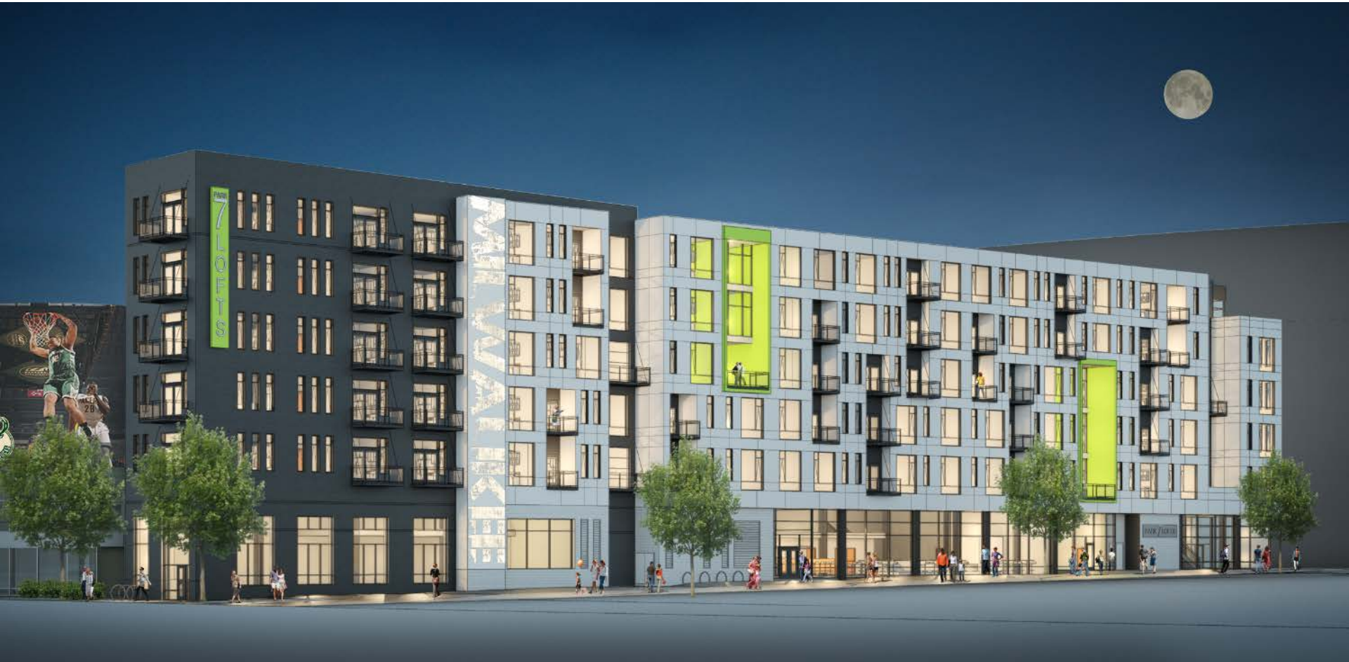
PROPOSED DESIGN – VIEW FROM NORTHWEST