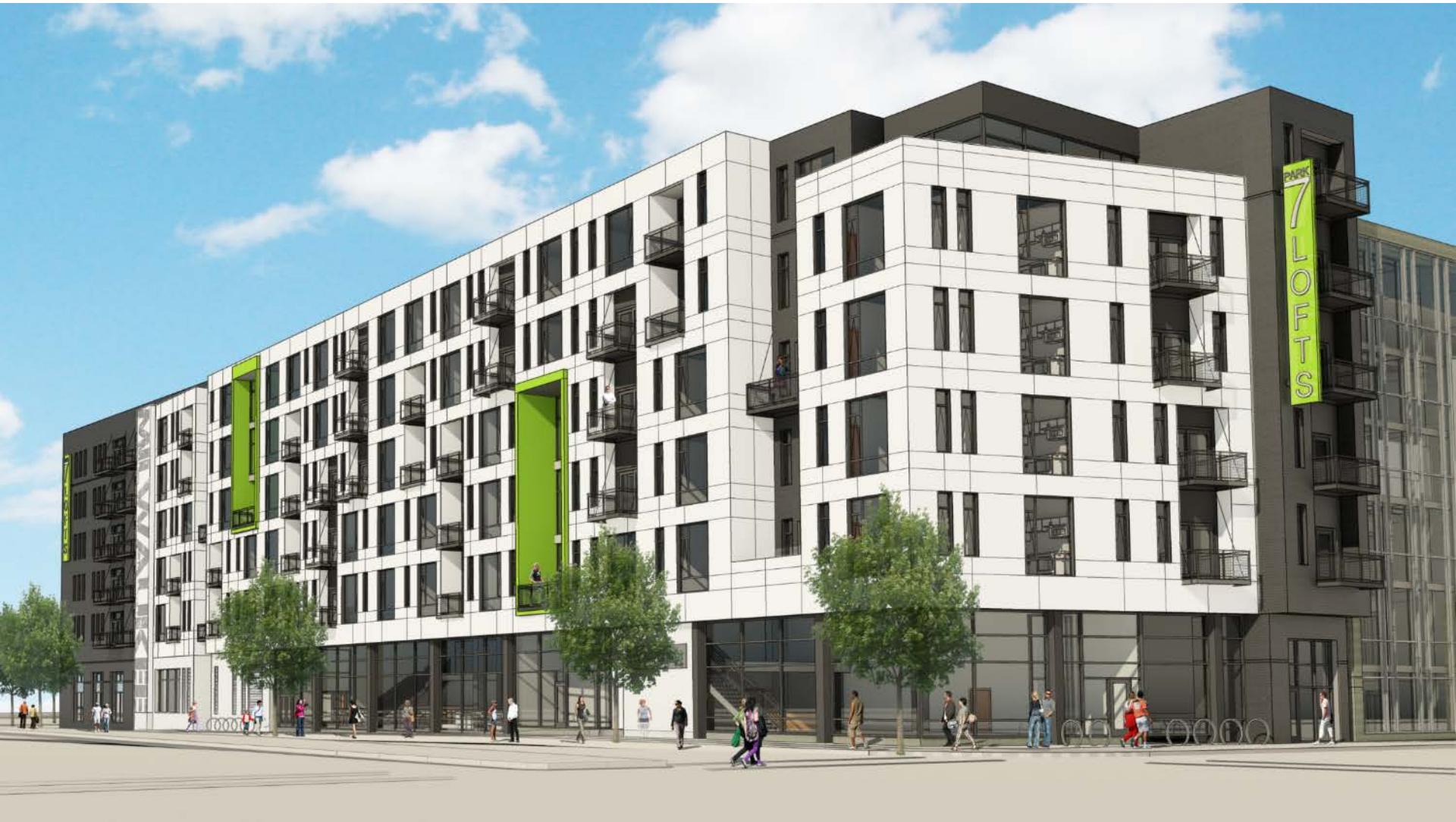
PROPOSED DESIGN – VIEW FROM SOUTHWEST