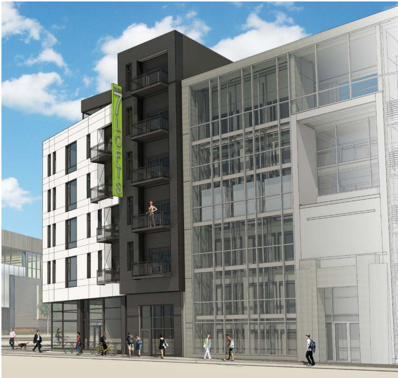
PROPOSED DESIGN – VIEW OF RESIDENTIAL ENTRY