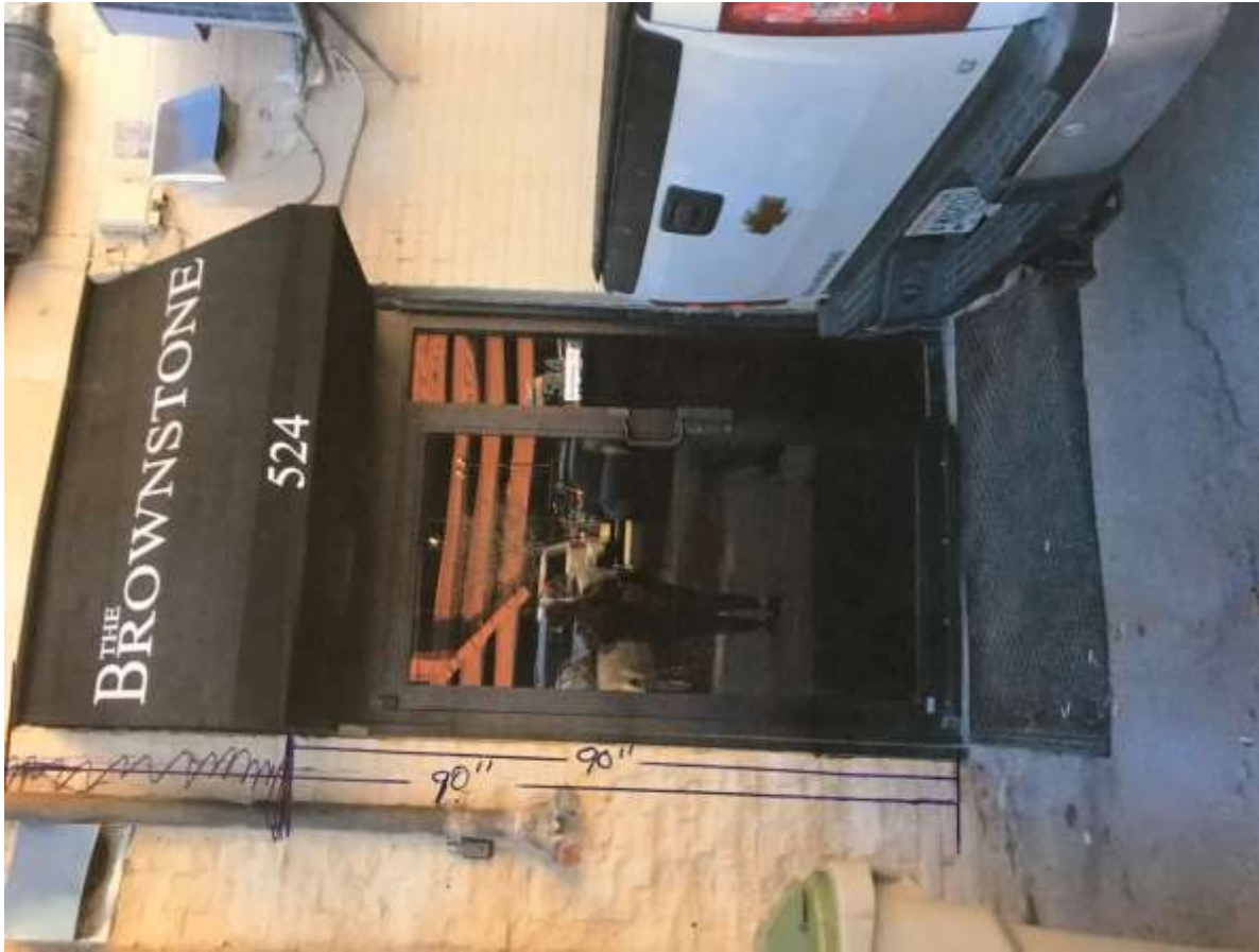
Rear canopy photo