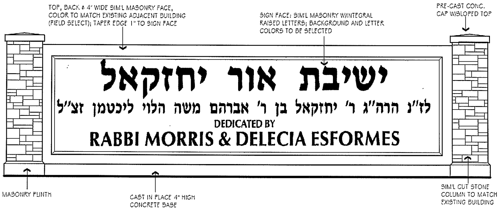
SIGN ELEVATION SCALE: 1/2" = 1'

Elevation of new sign. Signboard is 12 feet long and 3 feet in height.