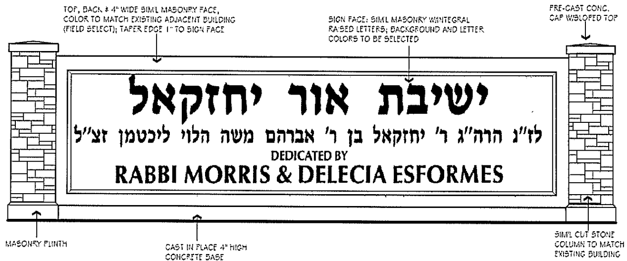
SIGN ELEVATION SCALE: 1/2"=1'