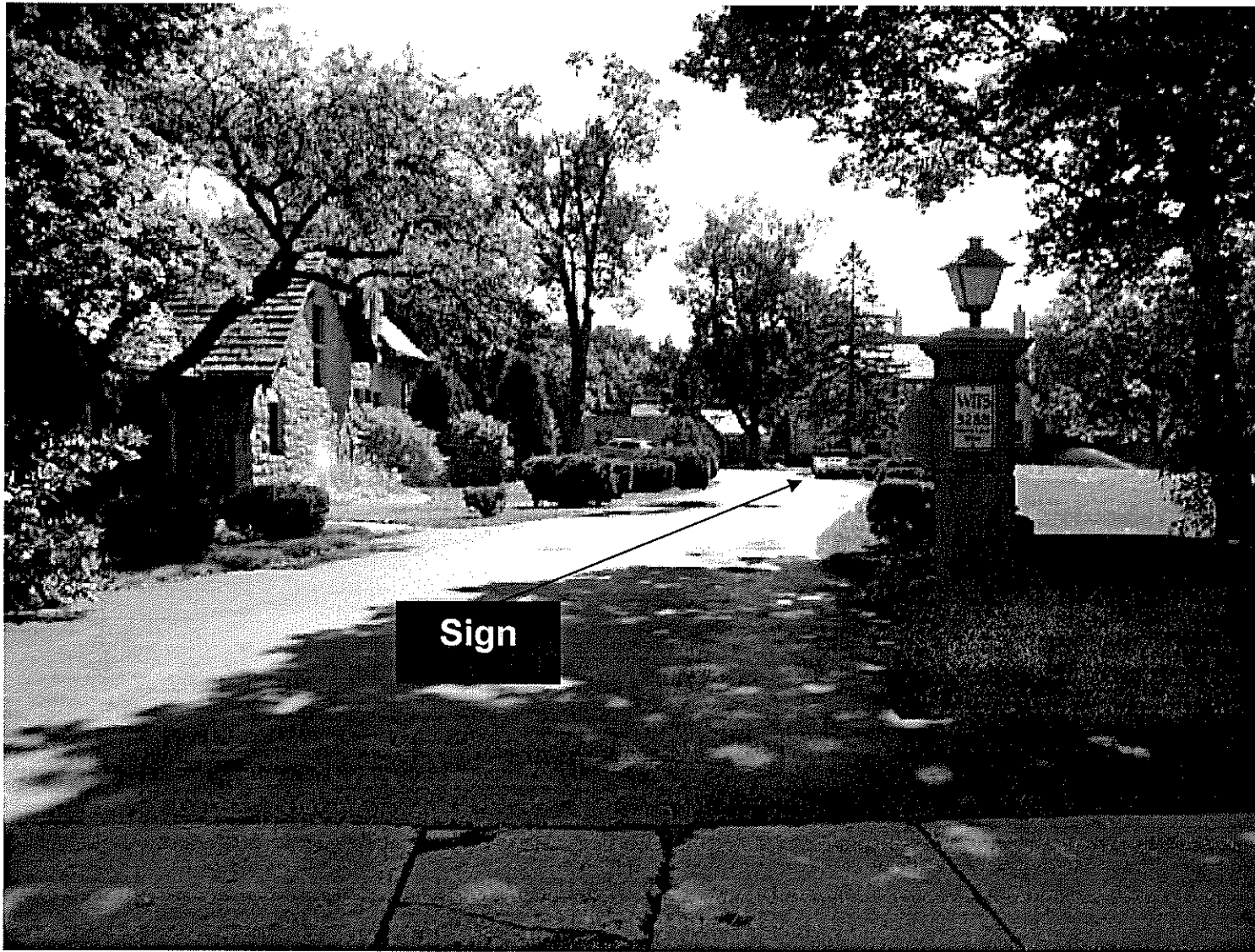
PROPOSED NEW PEDESTAL SIGN VIEW FROM LAKE DRIVE