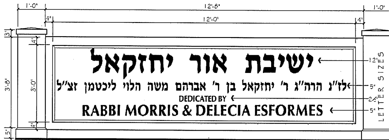
DIMENSIONS SCALE: 1/2"=1' NOTE: ALL DIMENSIONS APPROXIMATE. VERIFY WITH FABRICATOR

Dimensions and specifications for a free-standing monument type lawn sign which will be located near the foundation of the front elevation facing west.