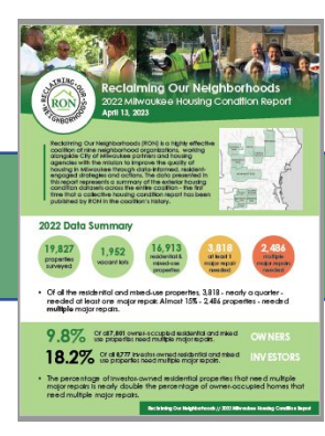
Data and Shared Learning

Take Root Rental Housing Resource Center Revitalize Habitat NIDs, NIPs Compliance Loan Program Community Warehouse ACTS Etc.