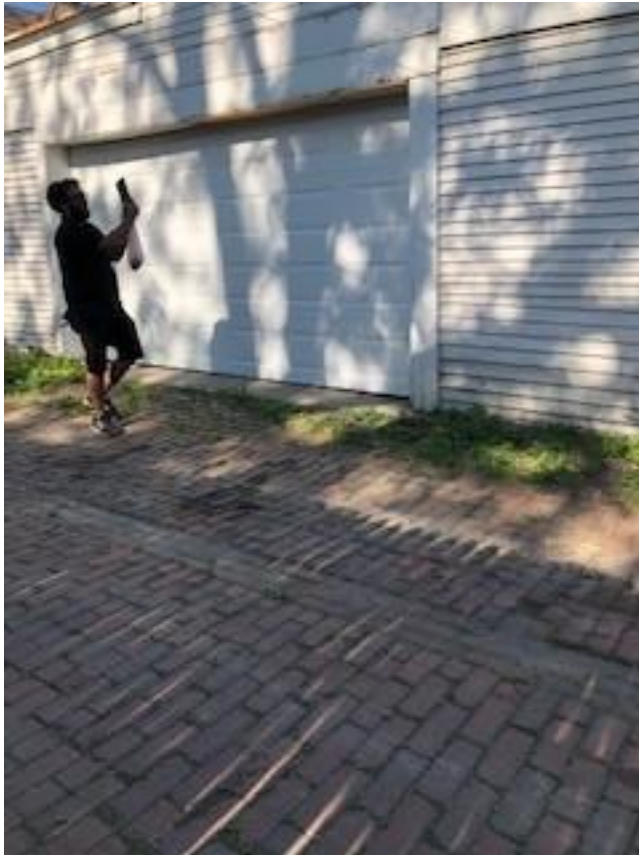
Garage overhead door as completed.