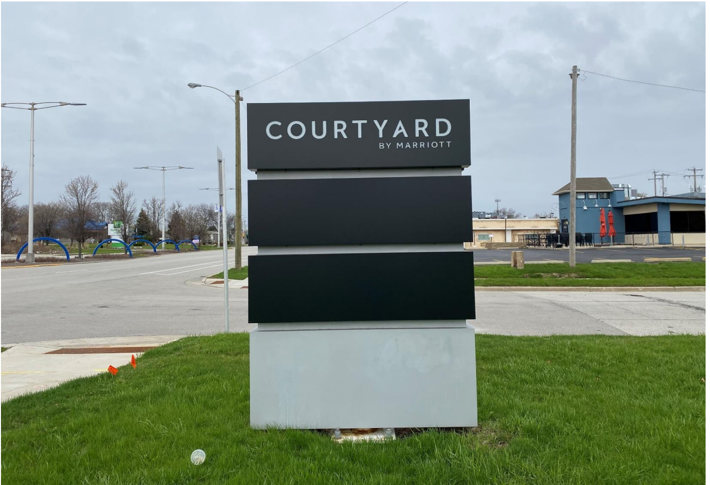
Existing Off-Premise Sign