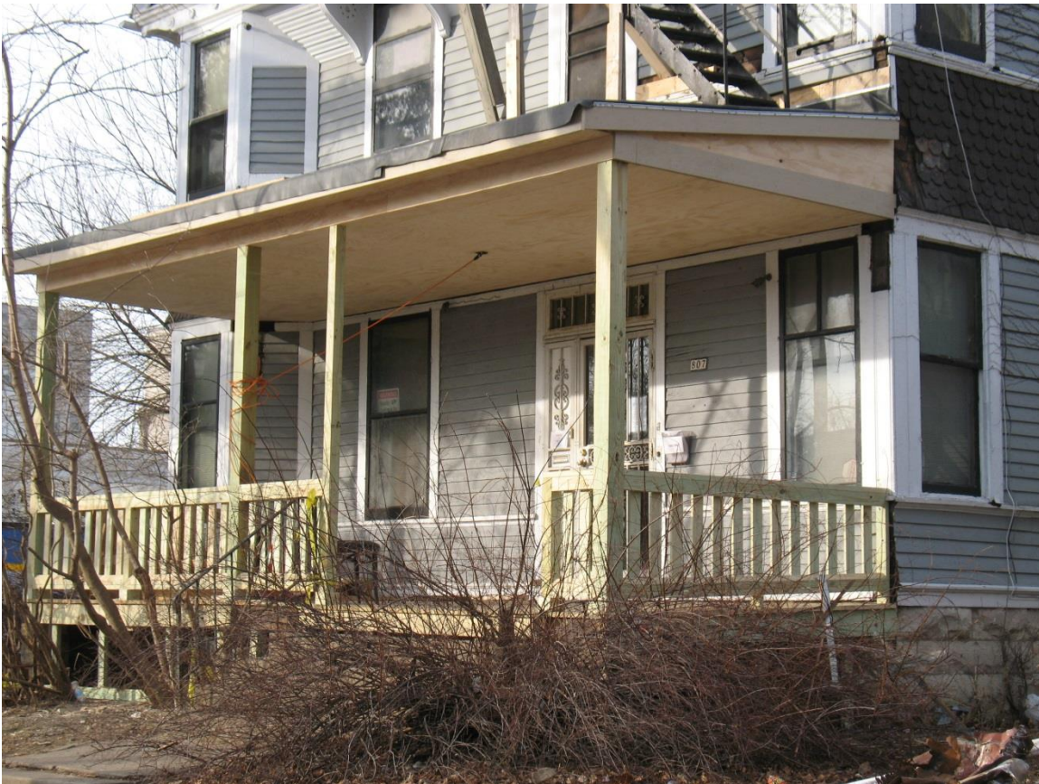
Newly constructed porch 2017