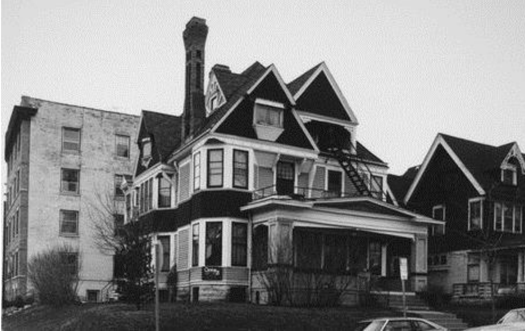
Survey Photo 1984