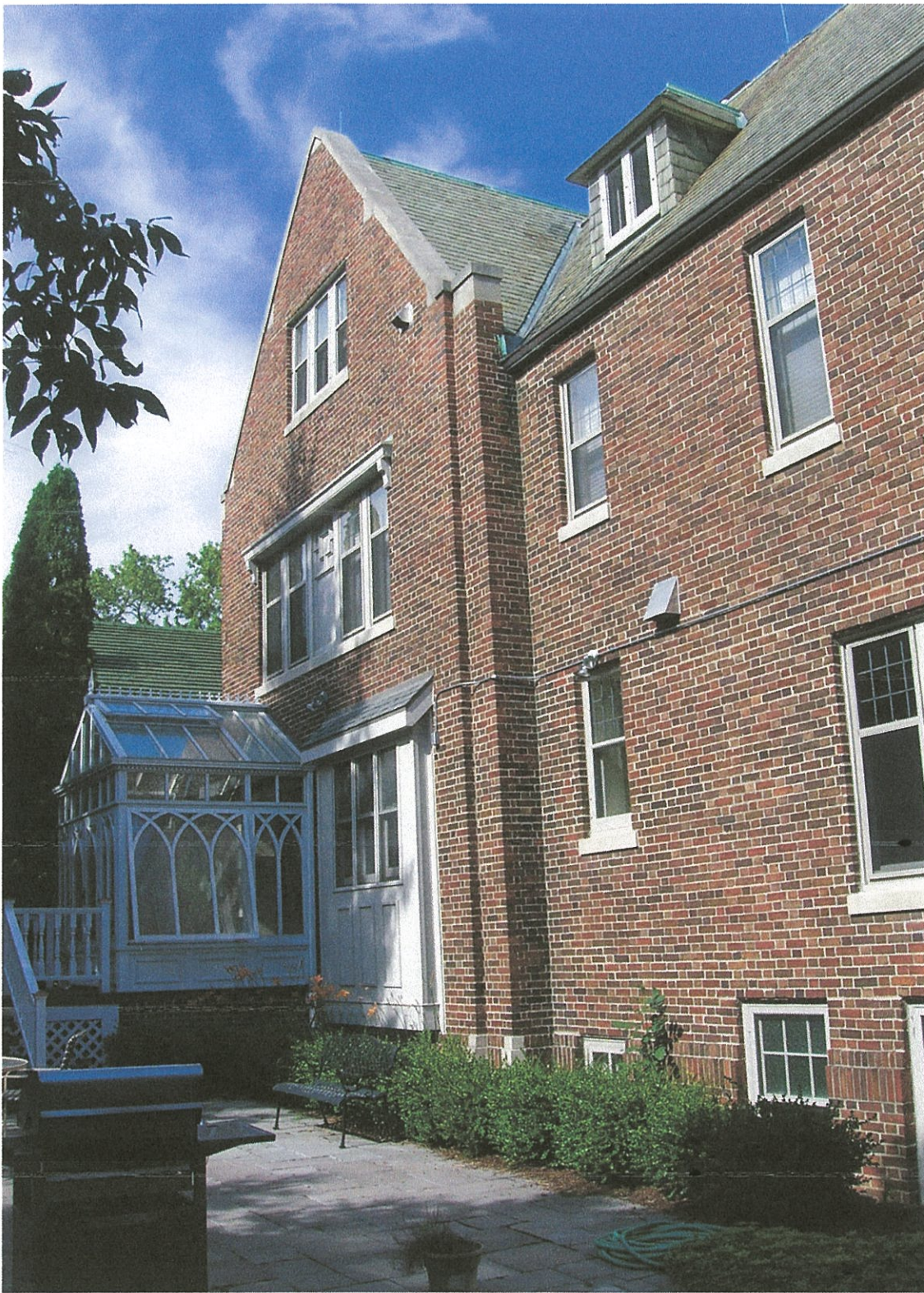
SIDE / SUNROOM ELEVATION