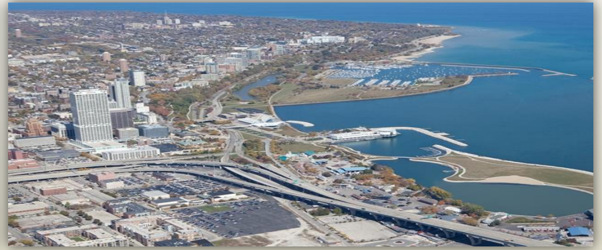
Milwaukee Gateway Project