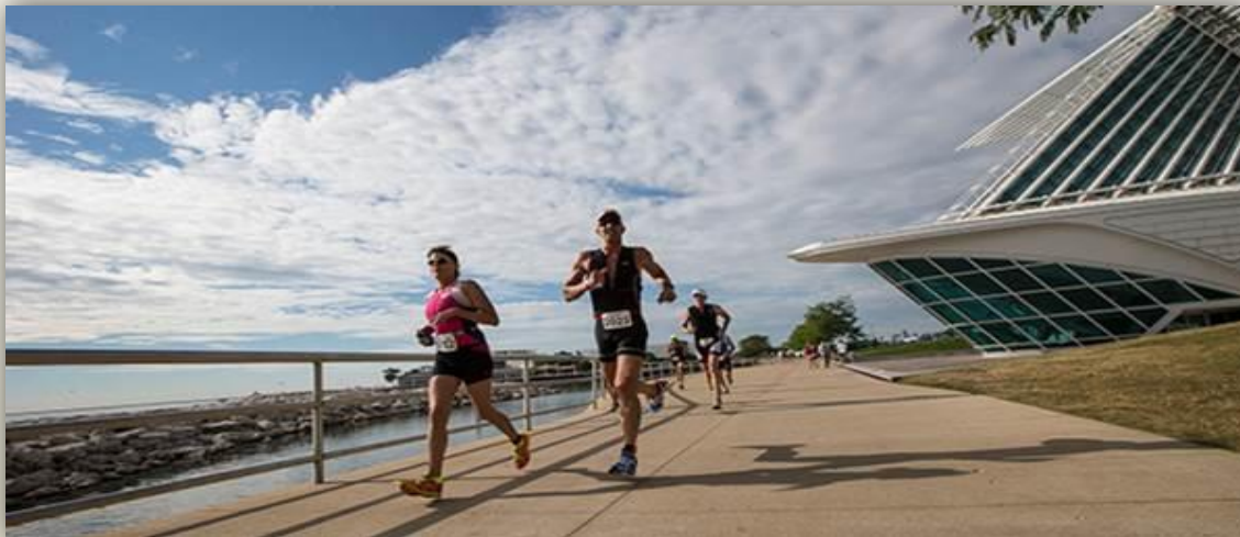
USA Triathlon Nationals 2014, 2015