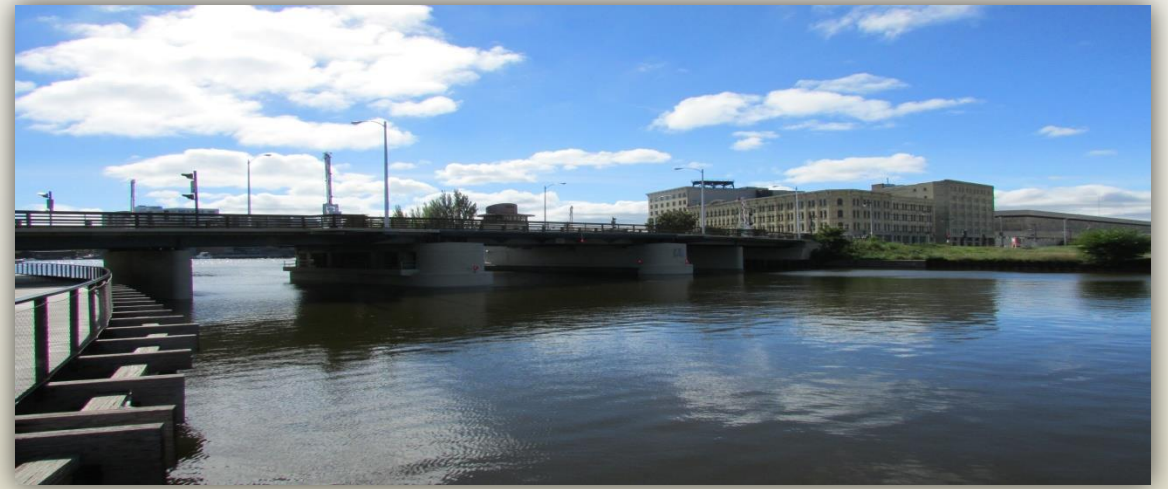
St. Paul Ave. Bridge re-opened on June 11, 2014