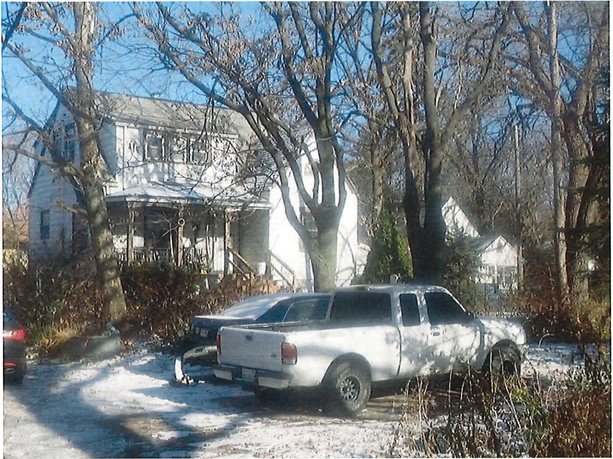
Above: Photo of the Subject Property (7020 W Mill Rd)