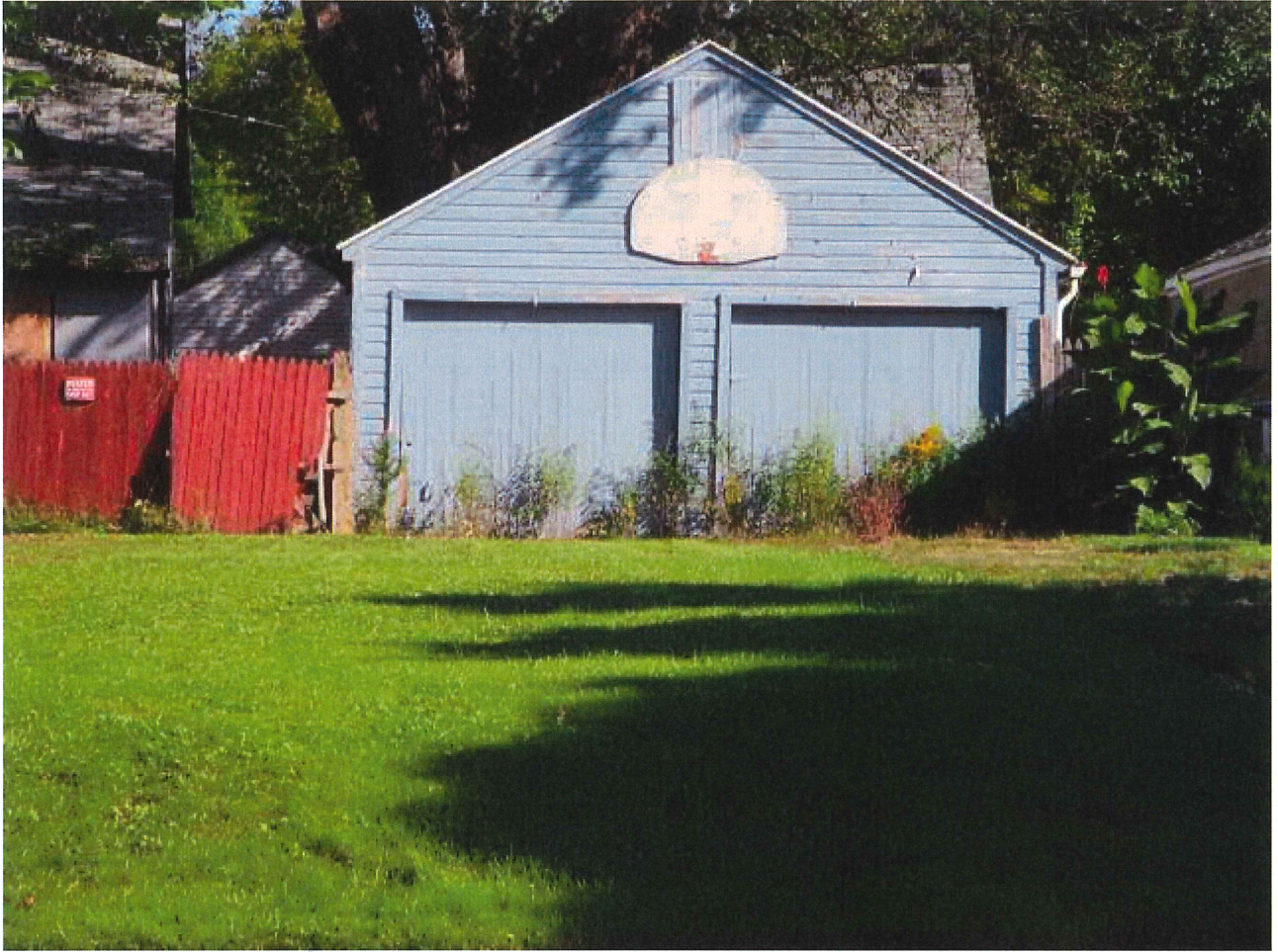
4230 W Thurston Ave