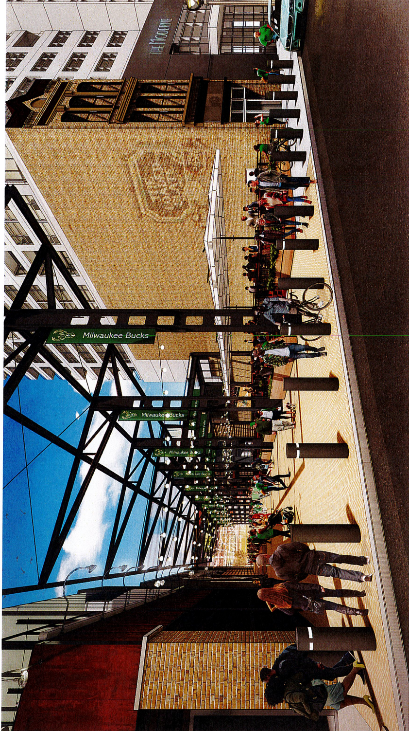
VIEW LOOKING WEST TOWARD 4TH STREET PLAZA FROM OLD WORLD 3RD STREET NOT TO SCALE

DATE JANUARY 17, 2018 SHEET NAME PERSPECTIVE VIEW SHEET NUMBER