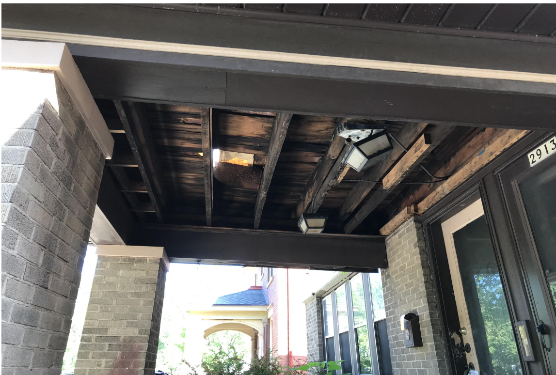
Photo 3 - Underside of Roof Porch Showing Rotted Wood Joists and Damaged Metal Decking