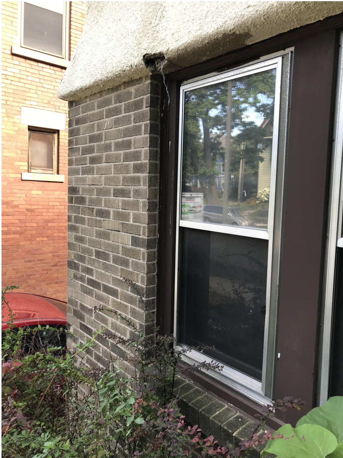
Photo 8 - East Window of North Facade First Floor Showing Damage to Existing Stucco Above Window