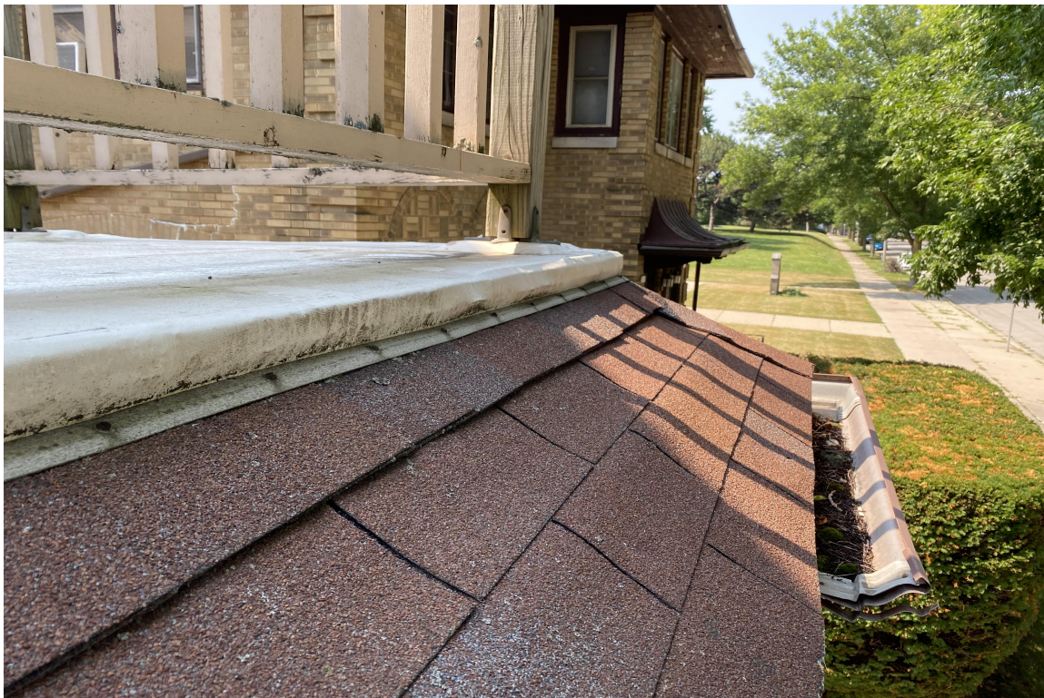
Photo 10 - Roof Porch Showing Membrane, Asphalt Shingle Roofing, and Wood Handrails