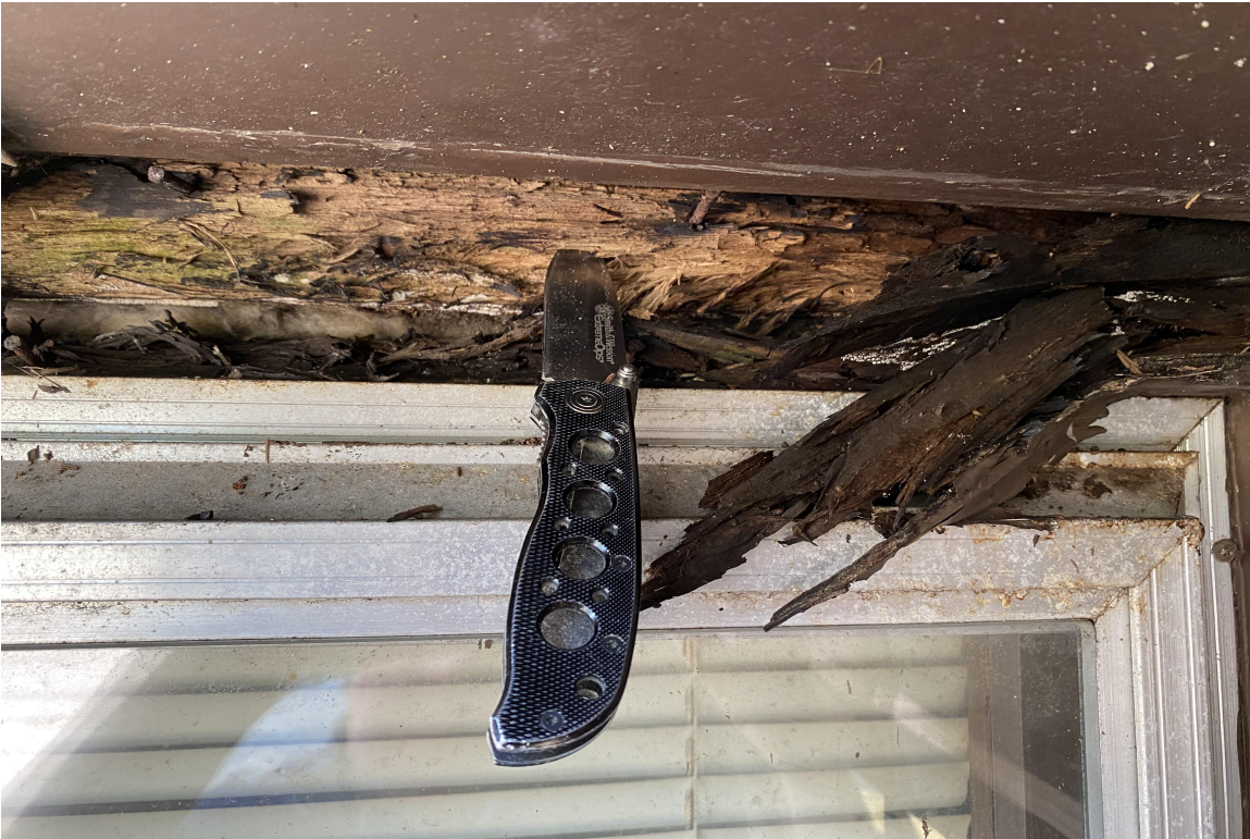
Photo 9 - Damaged Wood Header Above First Floor Windows