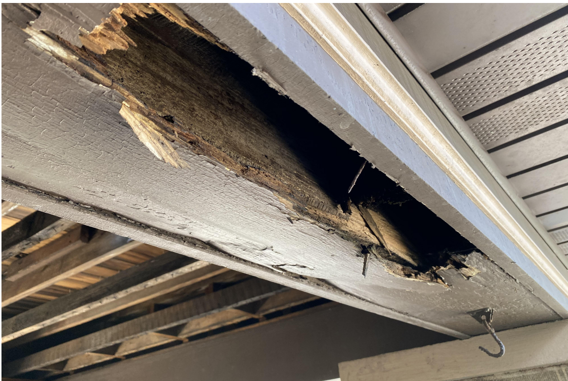
Photo 7 - Underside of East Boxed Beam Showing Rotted Wood from Water Damage