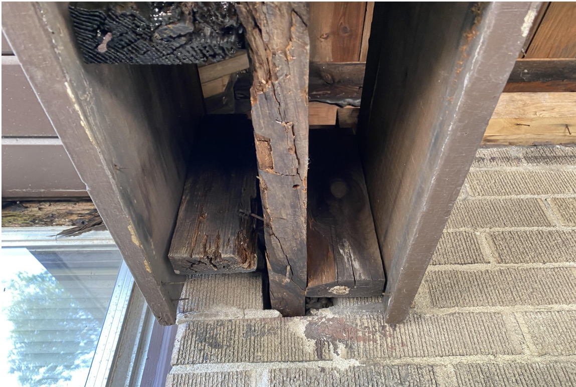
Photo 6 - Underside of East Boxed Beam Showing Rotted Wood from Water Damage