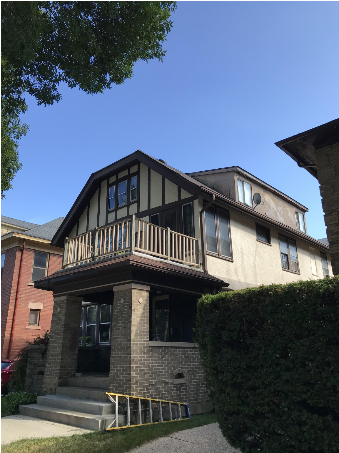
Photo 1 - View of Northwest Corner Showing Existing Dormer on West Facade and Existing Front Porch & Handrailing