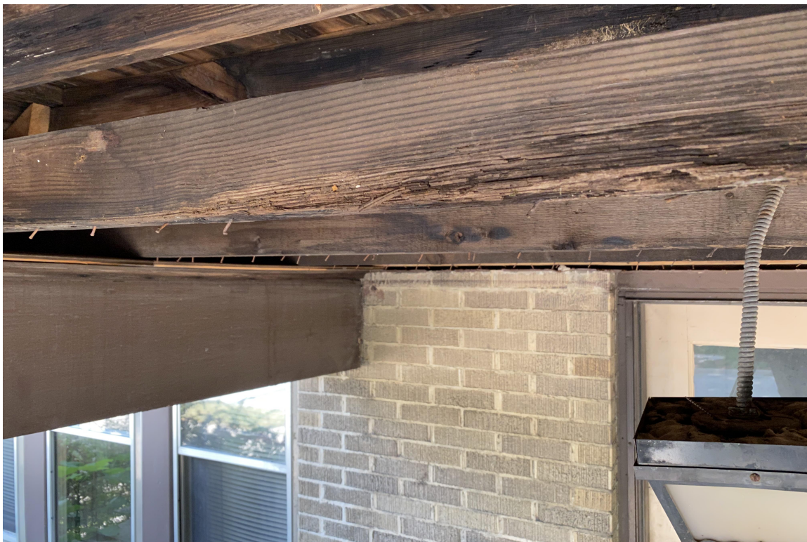
Photo 12 - Underside of Roof Porch Showing Condition of Wood Joists