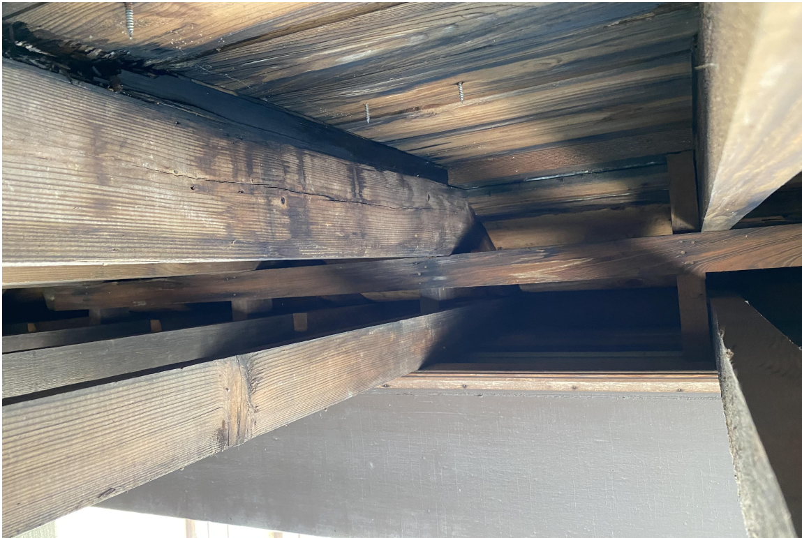
Photo 11 - Underside of Roof Porch Showing Condition of Wood Joists