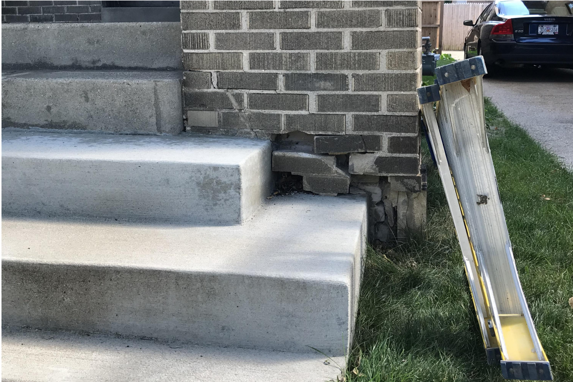
Photo 2 - Damaged Masonry at Base of Brick Columns Supporting Roof Porch