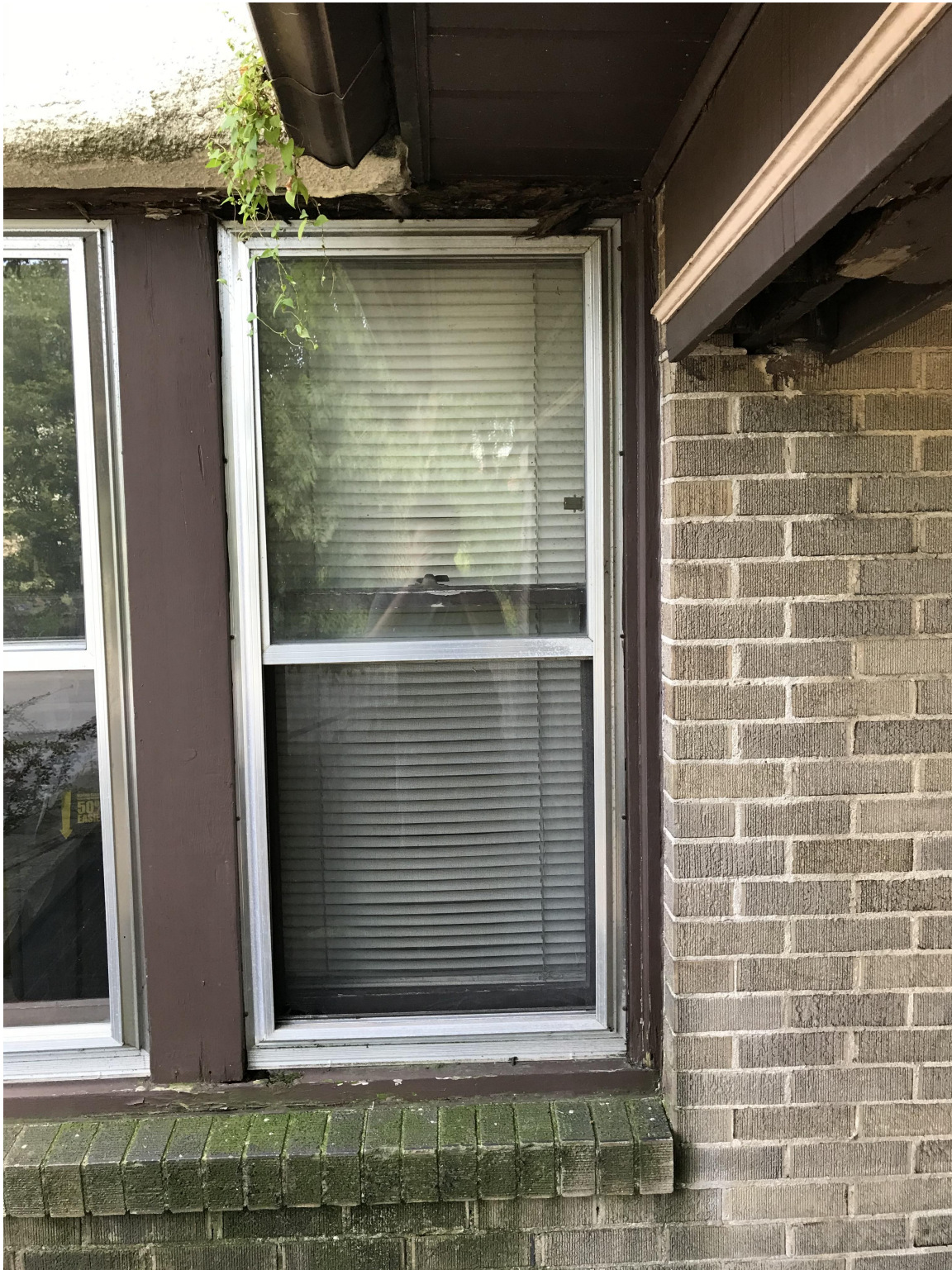
Photo 4 - West Window on North Facade First Floor Showing Rotted Wood at Header and Sill. Damage to Boxed Beam Shown in Upper Right Corner