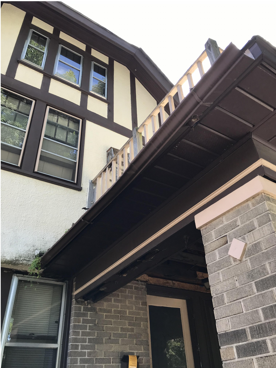
Photo 5 - Underside of Roof Porch Showing Damaged Gutter, Soffit, Boxed Beam, and Existing Wood Handrailing