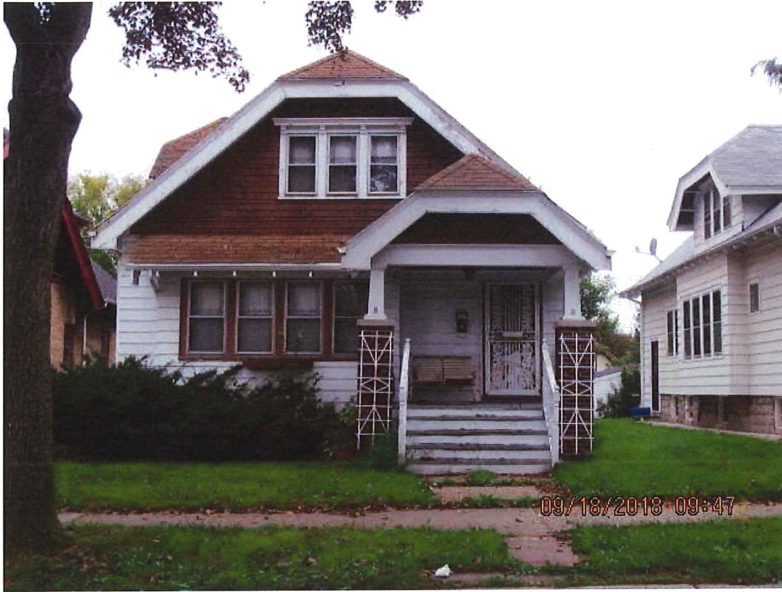
3565 North 14 th Street