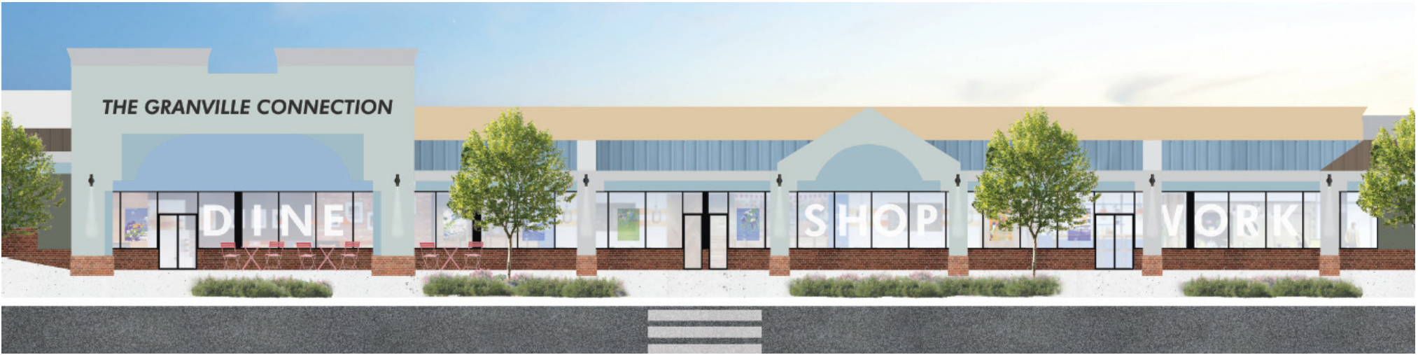
Proposed Facade Enhancements