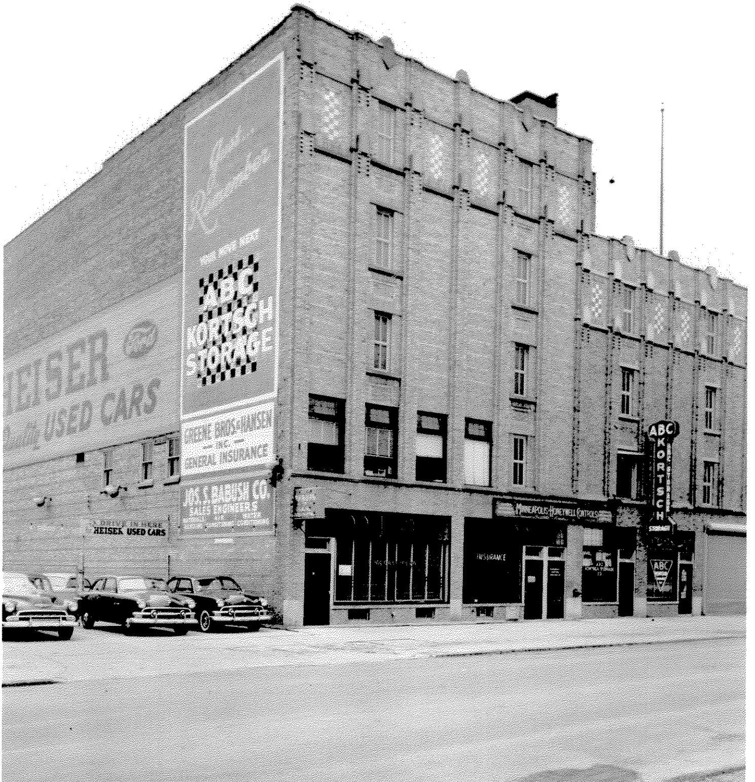
2403 N. MARYLAND AVE MILWAUKEE WI