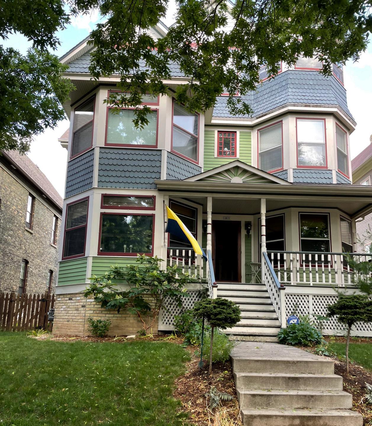
Dugan House 1825 N 1 st St