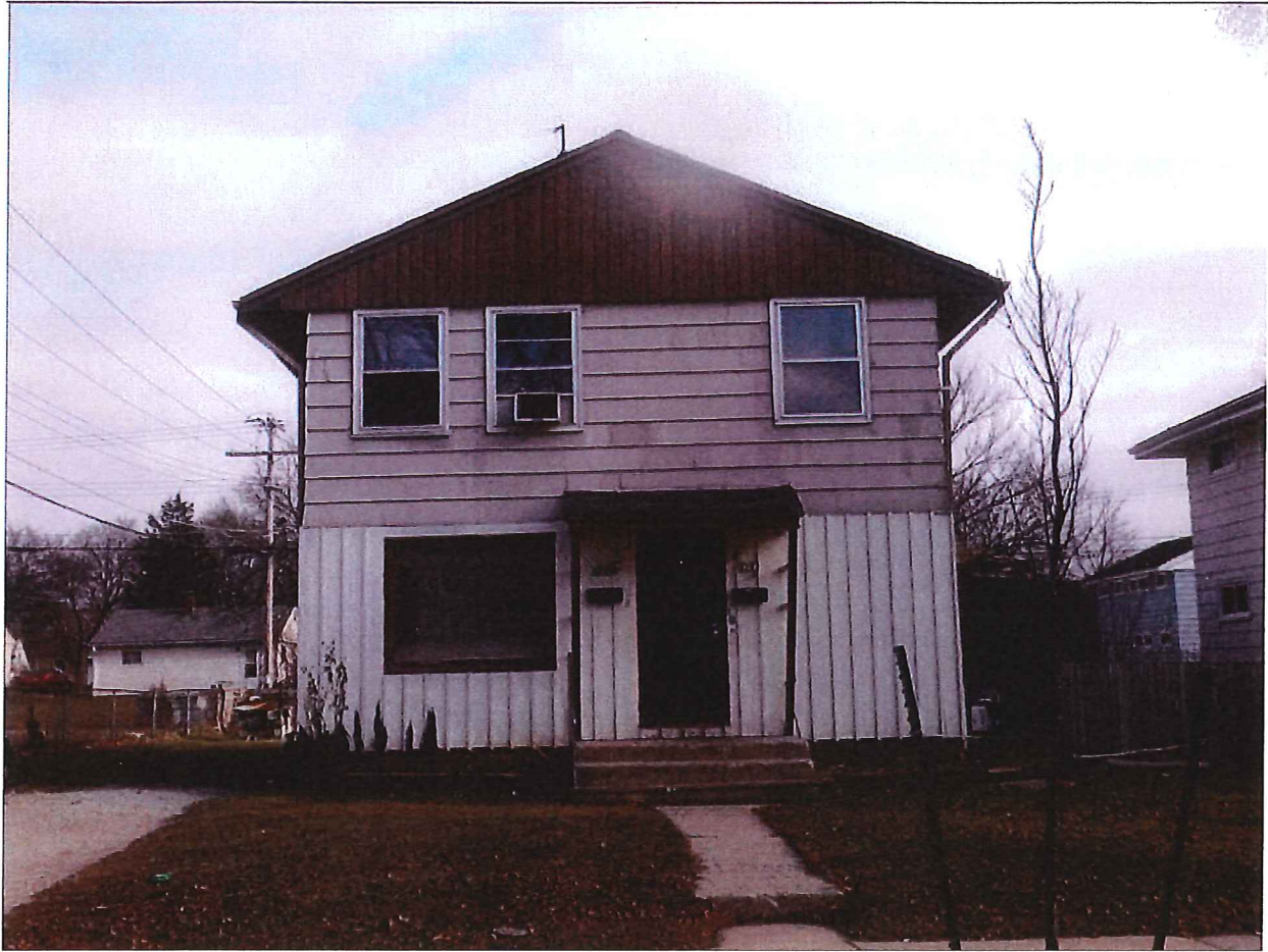
5700-02 North 61 st Street