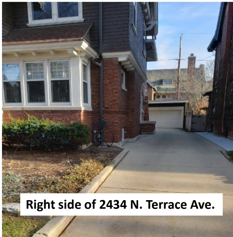
Right side of 2434 N. Terrace Ave.