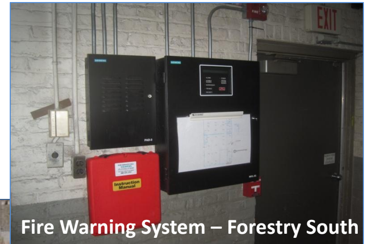
Fire Warning System – Forestry South