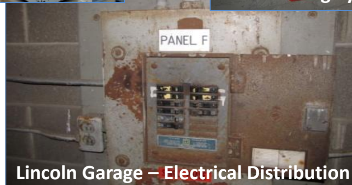
Lincoln Garage – Electrical Distribution