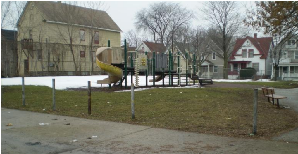
26 th and Medford Play Area 2476 North 26 th Street 15 th Aldermanic District