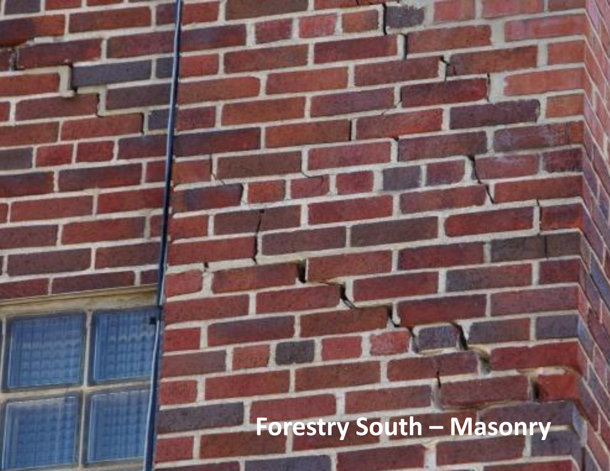
Forestry South – Masonry