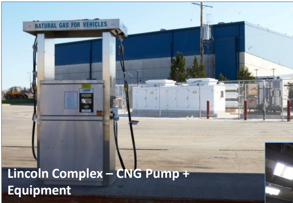
Lincoln Complex – CNG Pump + Equipment