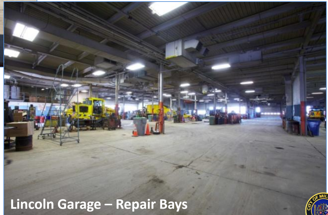
Lincoln Garage – Repair Bays