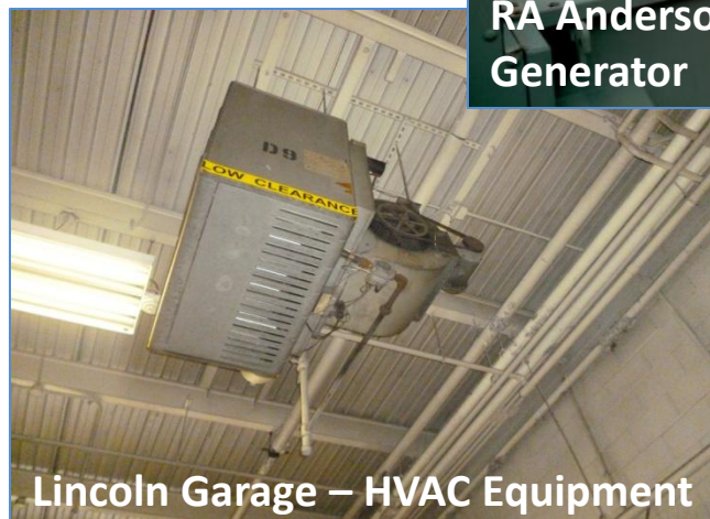
Lincoln Garage – HVAC Equipment