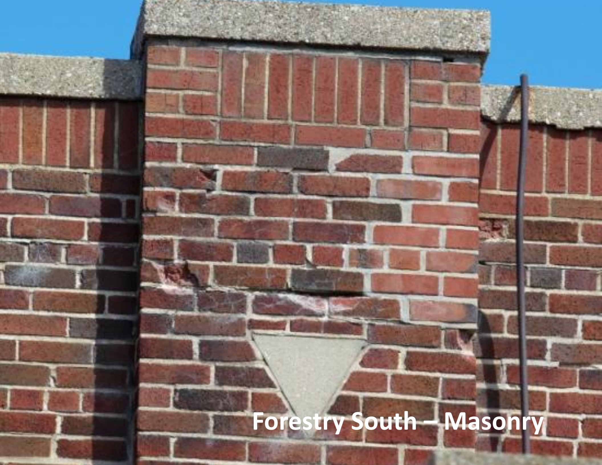
Forestry South – Masonry