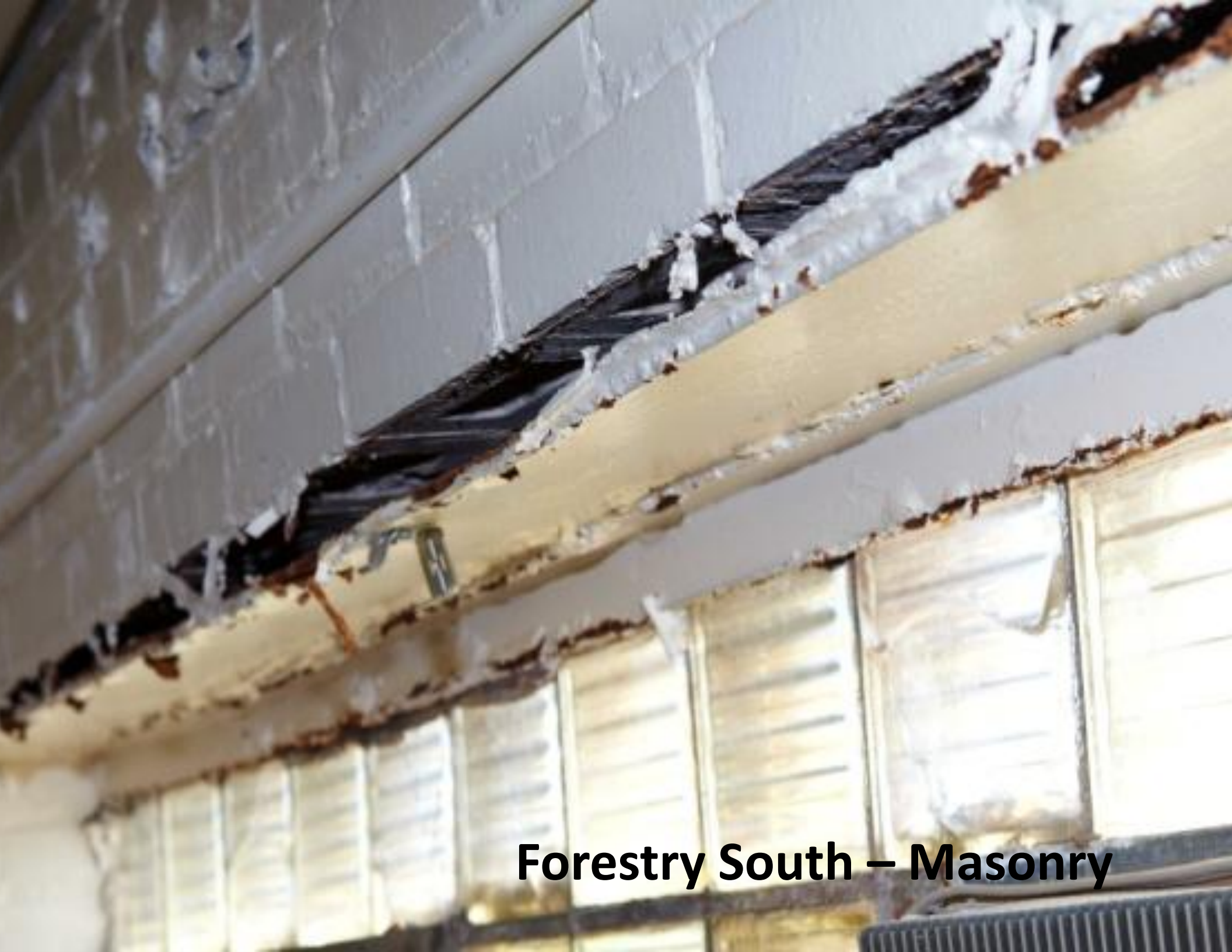
Forestry South – Masonry