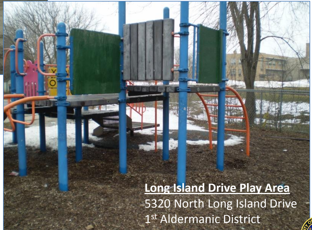
Long Island Drive Play Area 5320 North Long Island Drive 1 st Aldermanic District