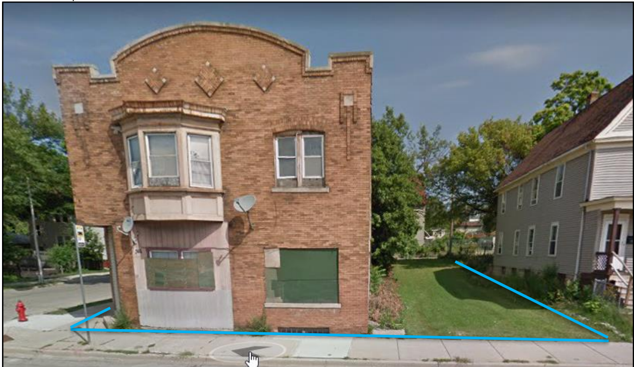
3610 & 3616 West Vliet Street (current conditions)

The building will be used as the headquarters of Pachamama LLC. This purchase will allow the Buyer to expand its already growing business. Currently, Triciclo Peru, located at 3801 West Vliet, is sharing its kitchen. The acquisition of 3616 West Vliet will allow Pachamama to have their own kitchen that will enable them to grow their business and offer another nearby retail outlet to serve their products.