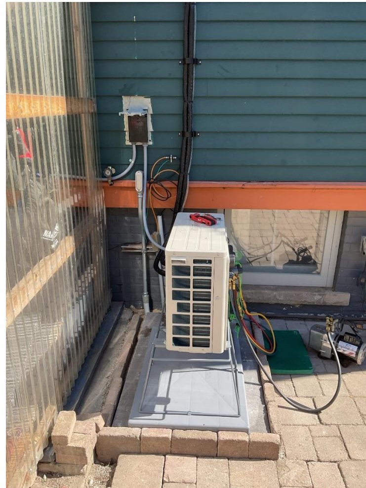
Existing unit at the rear of the house