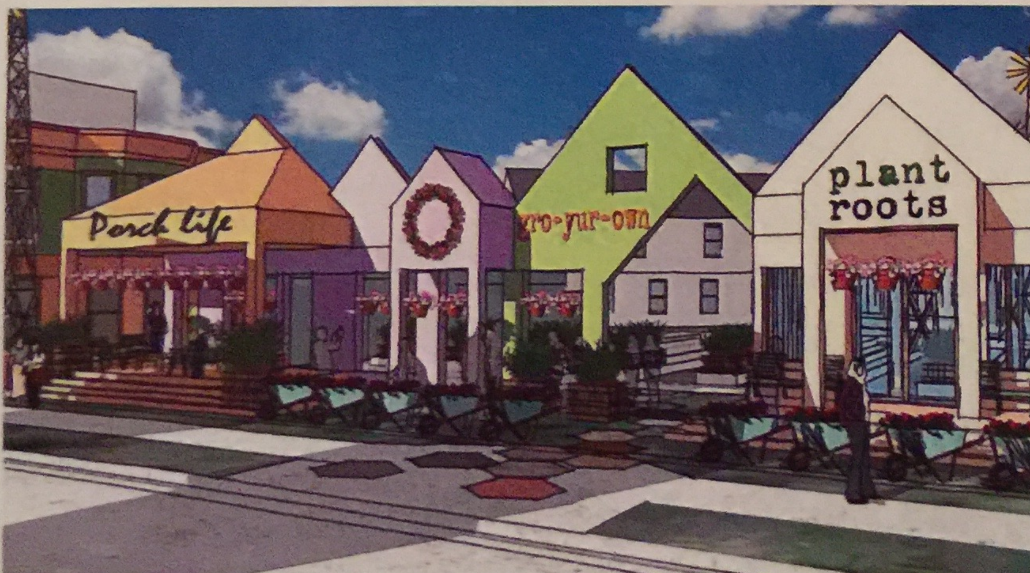
Rendering of the Adams Garden Park.

Tom Daykin, Milwaukee Journal Sentinel Published 10:19 a.m. CT July 13, 2017 | Updated 5:12 p.m. CT July 13, 2017