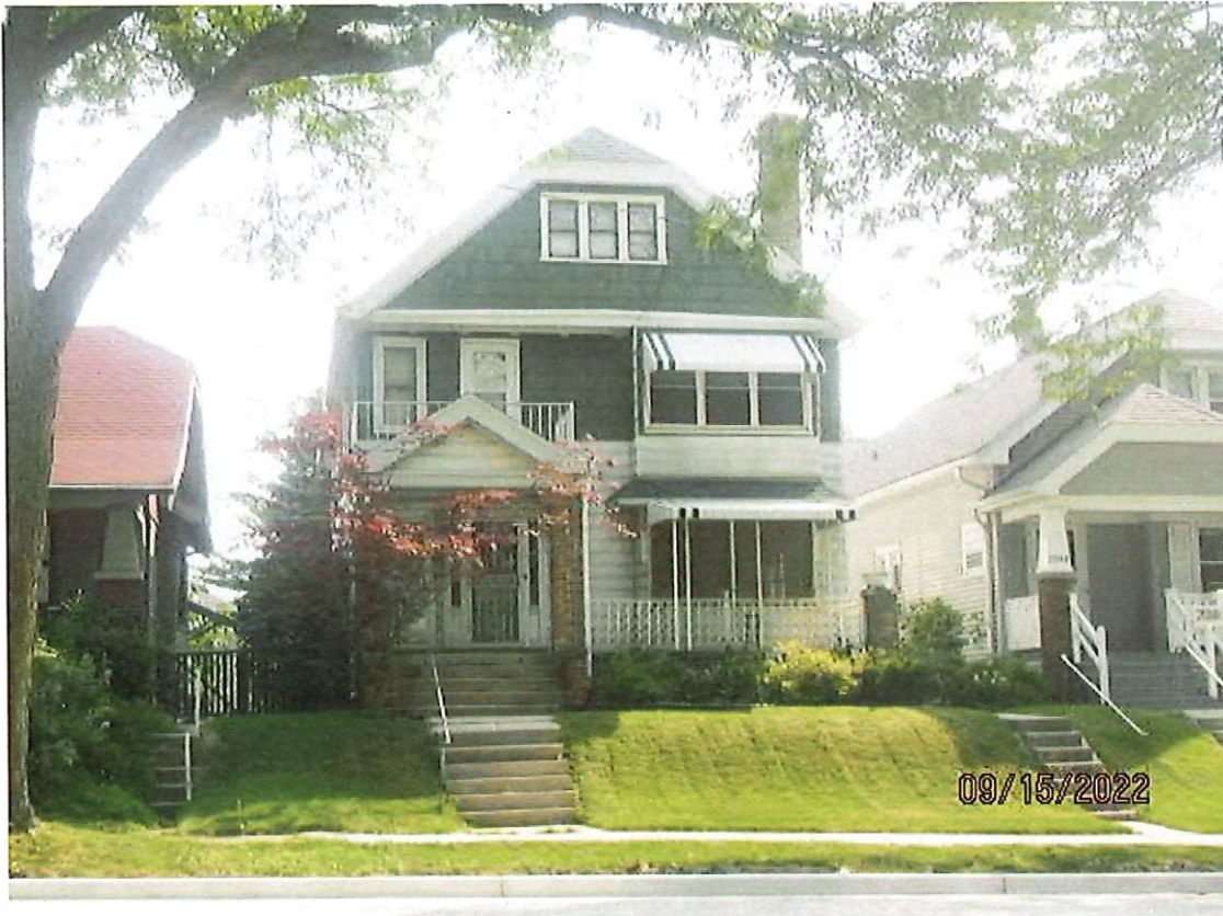
2344-46 N Humboldt Blvd