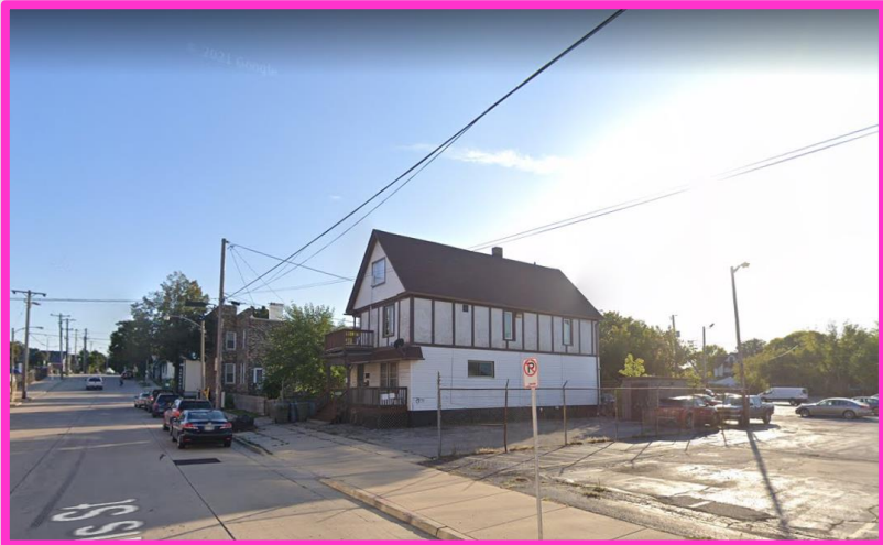
View from S Allis St looking southwest