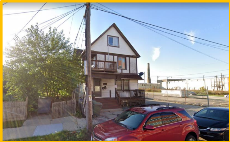
View from S Allis St looking west