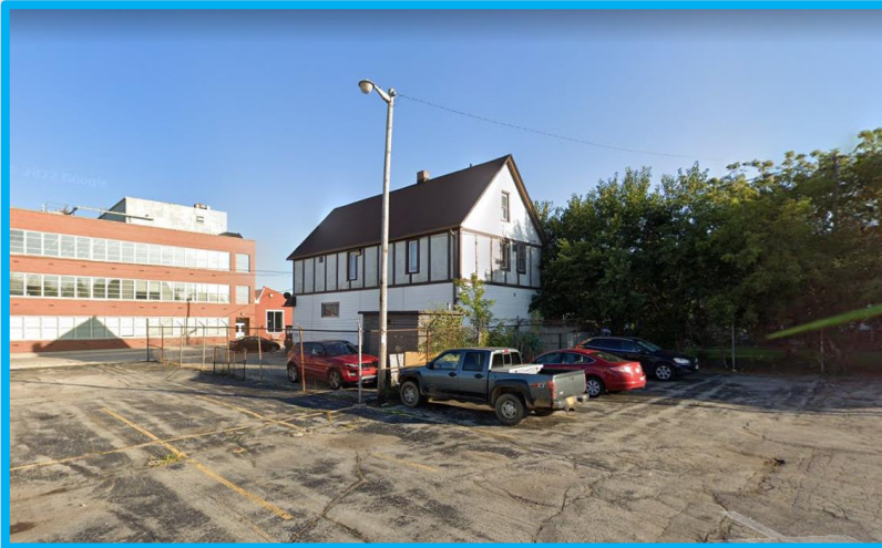
View from parking lot looking southeast