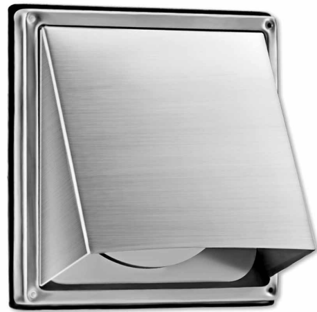
EXTERIOR STAINLESS STEEL THROUGH WALL VENT - PAINTED TO MATCH EXISTING TRIM PAINT

PROPOSED NEW WALL VENT LOCATION ON NORTH SIDE OF MASONRY WALL