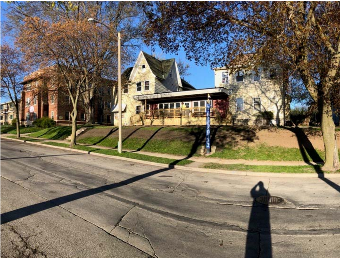
2424 W. Kilbourn new roof (24th & Kilbourn vacant lot in the foreground and 2432 in the background)