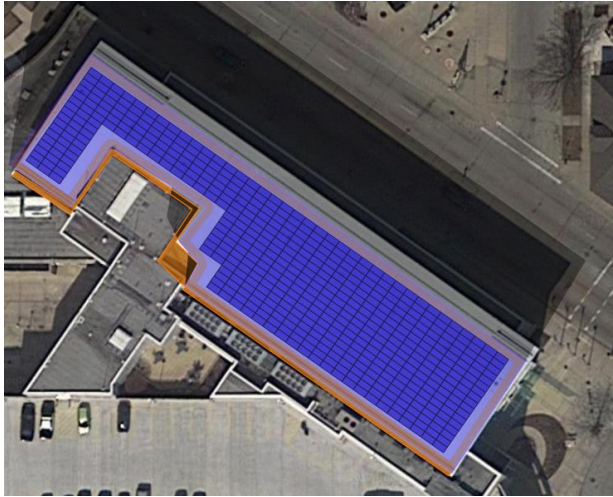
Helioscope image of Police District 3 PV roof