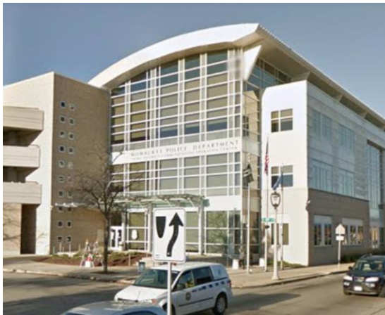
Google image of Police District 3's curved metal roof