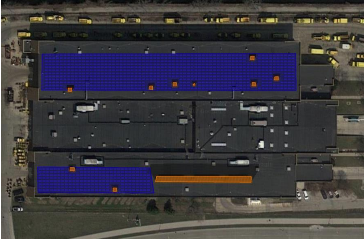
Helioscope image of the ~340 kW dc array