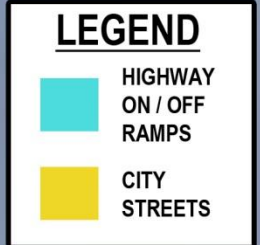
LAKEFRONT GATEWAY PROJECT - COMMUNITY STAKEHOLDERS