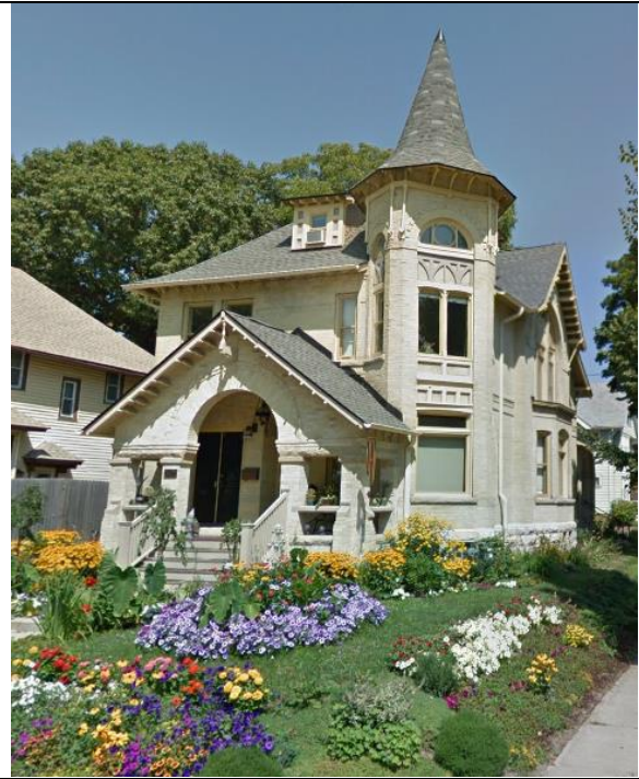
3402 West St. Paul Avenue, before and after