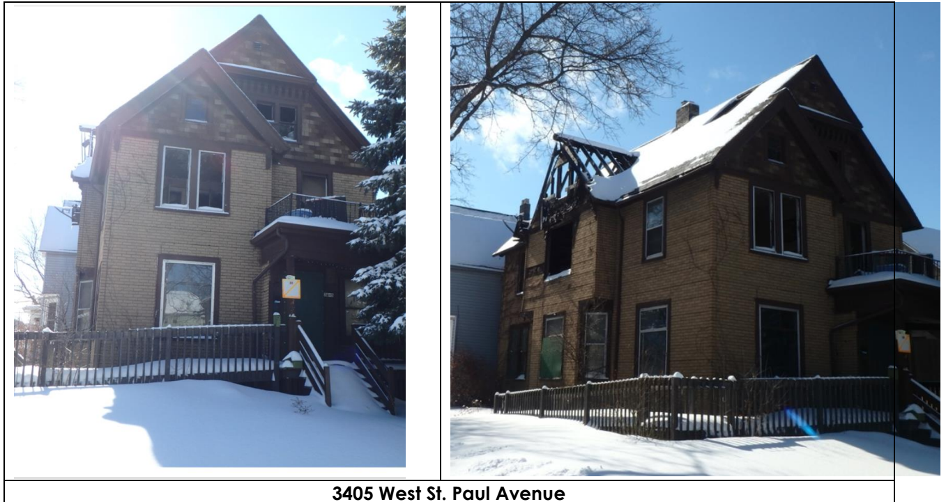
3405 West St. Paul Avenue

3405 West St. Paul Avenue was built in 1890 and is located in the Merrill Park neighborhood. The property was acquired in tax foreclosure on January 15, 2019. This property has been abandoned for several years and has severe fire damage. The property is condemned and has been referred for demolition.