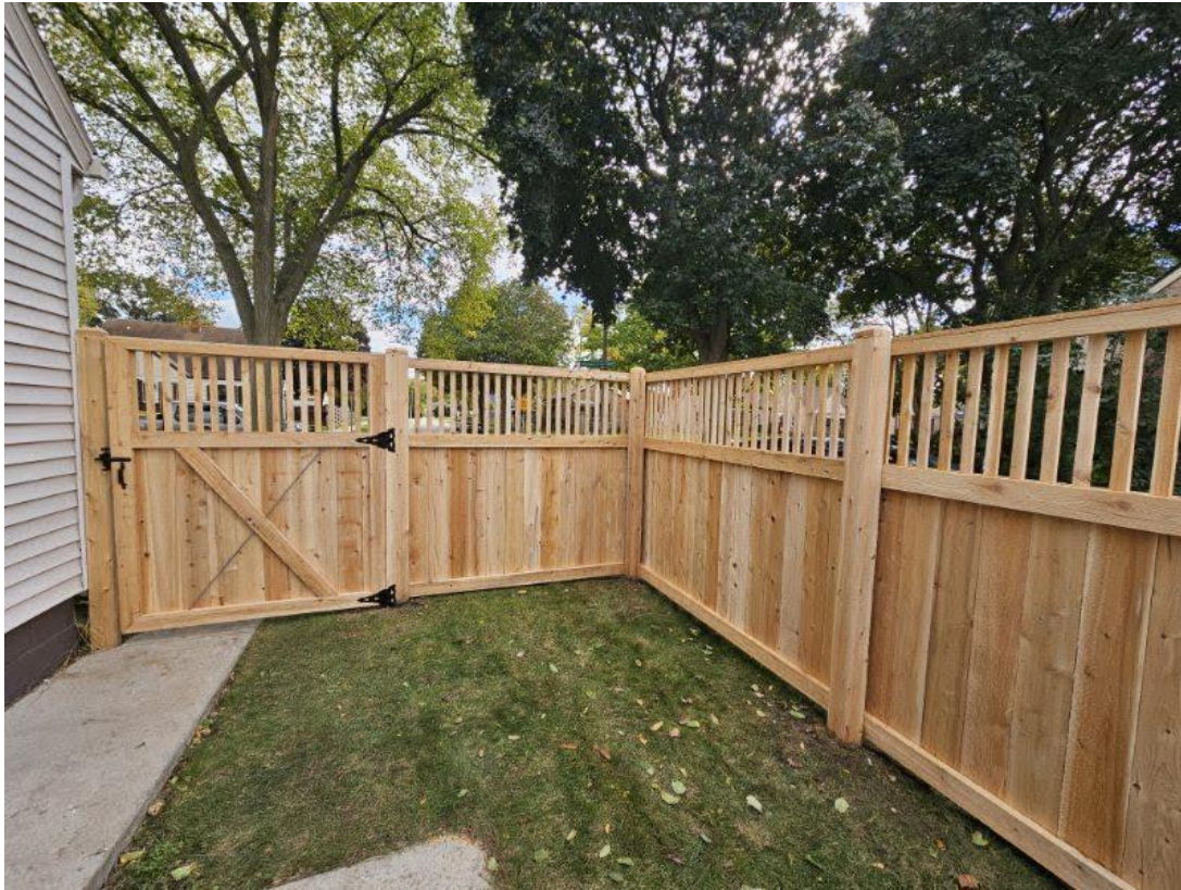
Design for section of fence in side yard