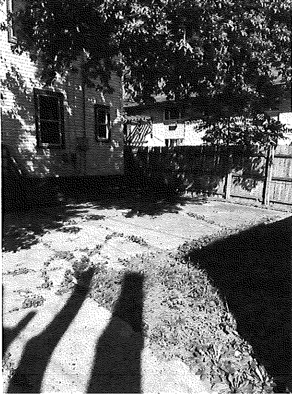
Rear Patch of grass appx 20'x7'