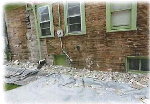
Before and After Exterior Repair

Forty homeowners received grants so far. The total amount of grants given out was over $120,000 that leveraged an additional $60,000. An additional $25,000 is committed to residents who are still currently making repairs and improvements. This puts the total up to $145,000. In addition, we were able to secure $20,000 from the Housing Trust Fund to help extremely low income homeowners, those earning below 30% CMI, to help repair roofs. The NID approved $20,000 to match that amount by moving