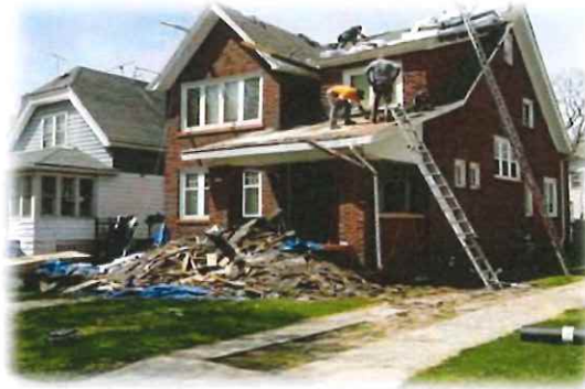
Before and After Roof Repair