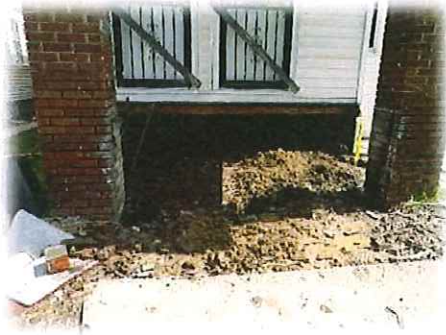
Before and After Porch Repair