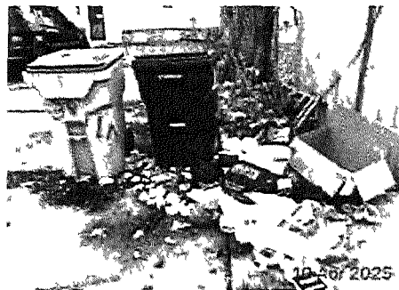
photo_20250410_095720_000 (1).jpg 182K