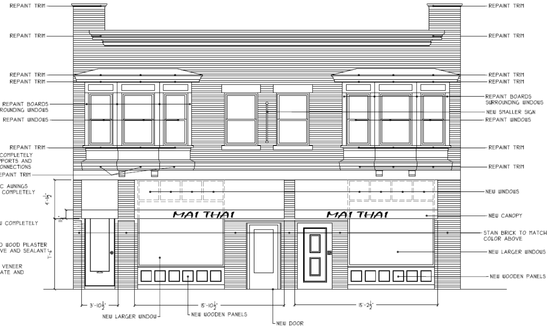
2 SOUTH ELEVATION Scale: 1/4"=1'-0"