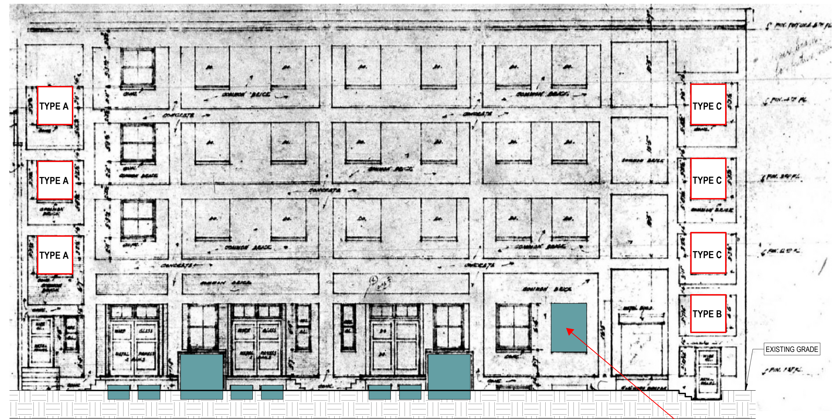
ORIGINAL EAST ELEVATION

INFILL OPENING CONSTRUCTION TO MATCH ADJACENT MATERIALS AND ASSEMBLY