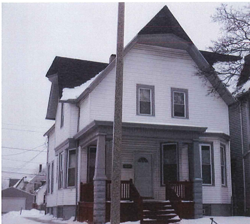
2925 North 11 th Street