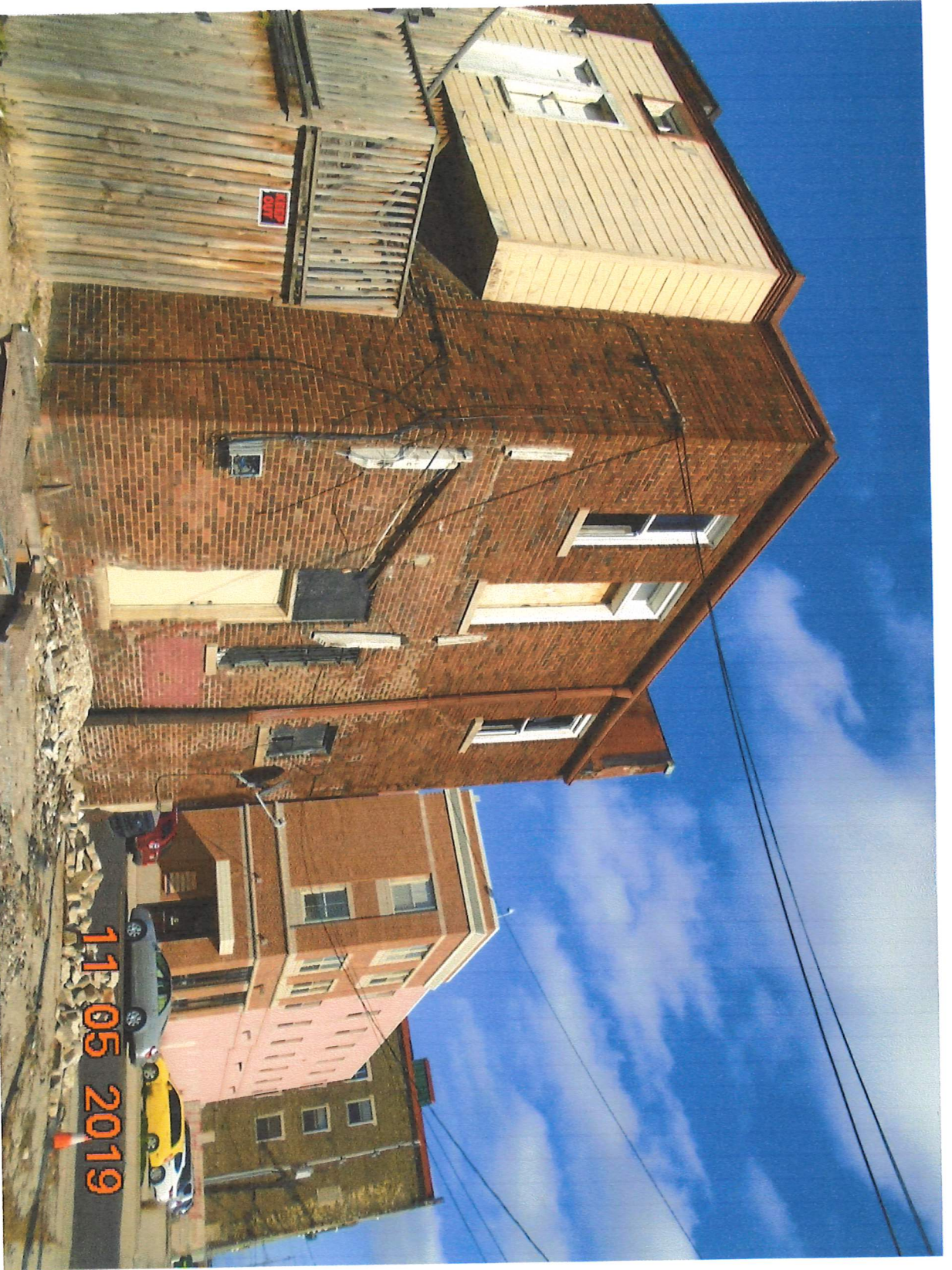
Rear of 701 building showing half-round gutter. Commission may require reconstruction of the jump porch that appears to have been removed without appropriate permits or Certificate of Appropriateness.