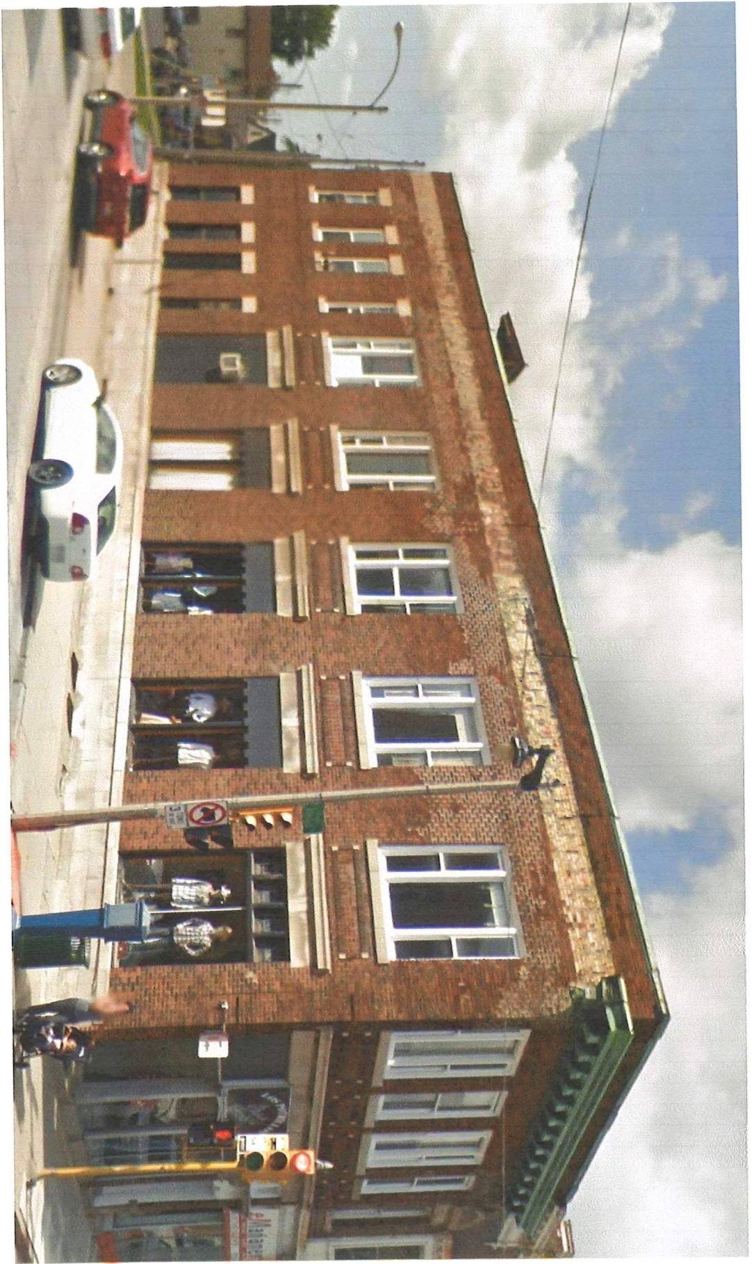
Subject wall for partial demolition.