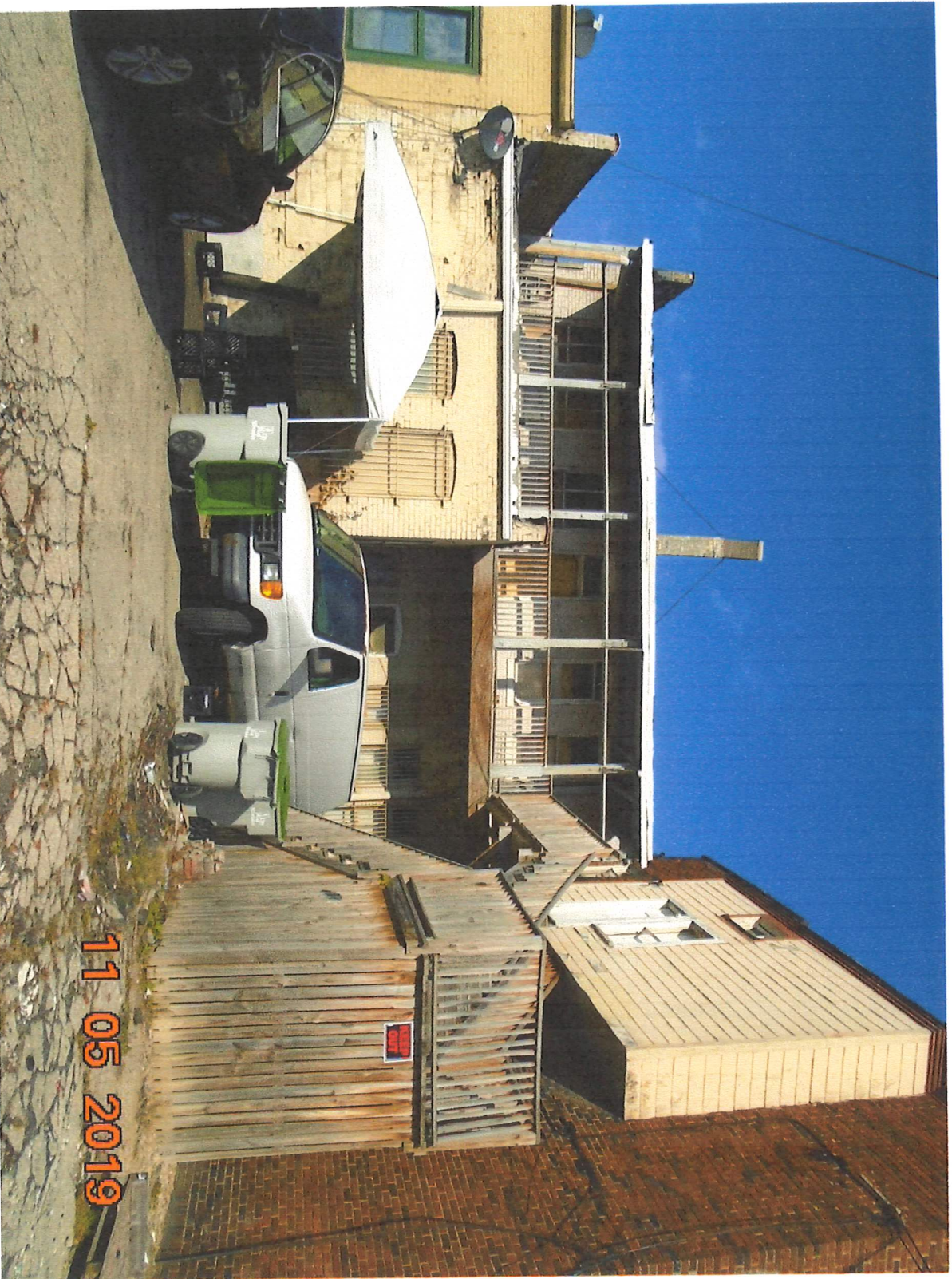
Rear of 705-707 building. Porch roof and all chimneys are to be removed. Porch over the rear bumpout (with bars on windows) shall be demolished, but columns and corbels shall be retained for reuse.