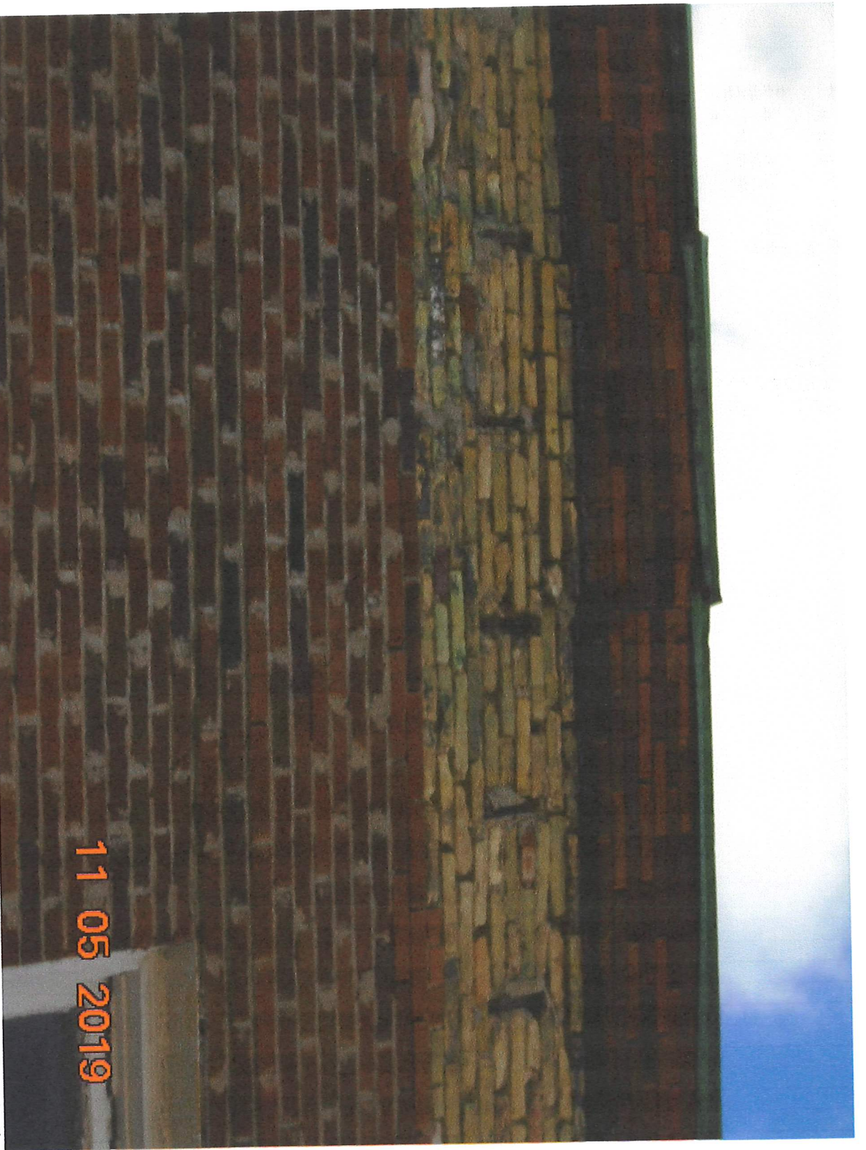
Detail of damaged area. Note subtle pilasters and copper coping. Pilasters and copper coping will be required in the reconstruction.