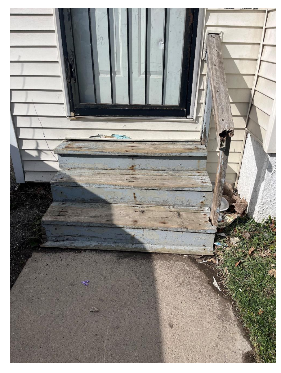
Stairs to be rebuilt.